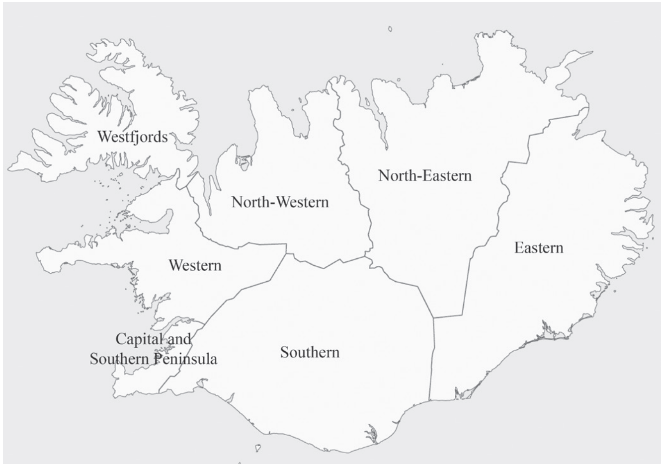
Appendix 1: Main Icelandic regions investigated from 2008 to 2017