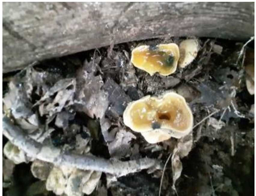
Figure 1. Entonaema cinnabarinum in Selyemrét Nature Trail; 47°15'56"N 19°13'50"E; on bark of decaying Fraxinus angustifolia subs. pannonica.

differences can be observed between young and old specimens. Young ones have a distinctive appearance with a light reddishyellow or orange color. Stromata of E. cinnabarinum is turgid and resilient when fresh and the colored ectostromata surrounds the perithecia with the liquid-filled cavity, later becoming more reddish brown and darkening and at maturity forms even blackening toward senescence. When liquid is released from stromata, they collapse and start to dry. Dried specimens are similar to Daldinia decipiens , which is a common species in the study area. Entonaema differs from Daldinia by having stromata with a hollow interior and by the perithecia that are arranged in a single layer beneath a thin crust and are easily flattened when being touched (Srutka et al. 2017). In this protected area, the mass occurrence of the species provides an opportunity for the monitoring of morphological changes of this species.