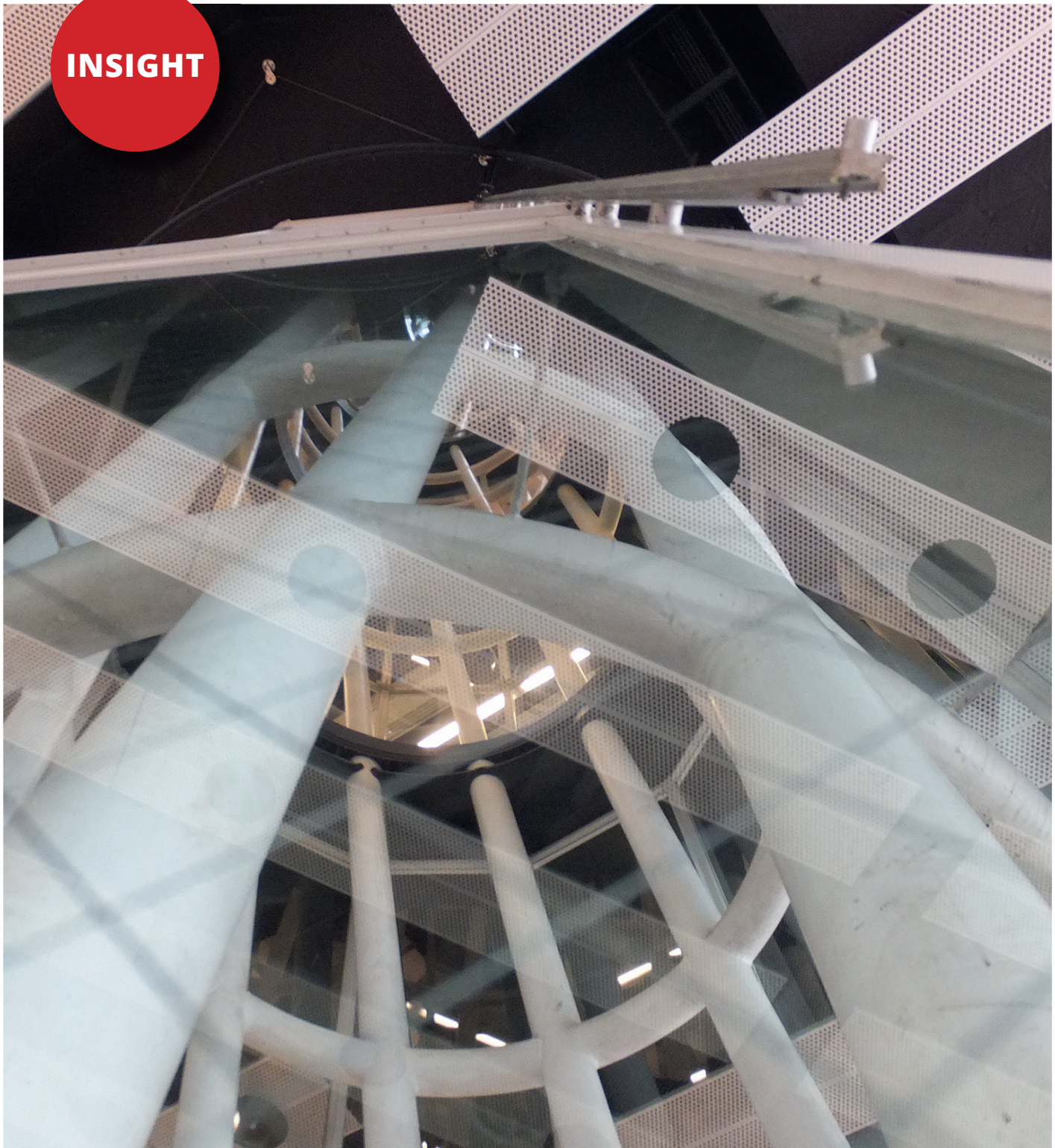
Sendai Mediatheque, Japan.