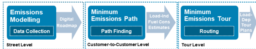
Figure 2: Tasks and flow of information in green urban transportation, adapted from [59]

data as well as the particular optimization tasks required to optimize green urban transportation services.