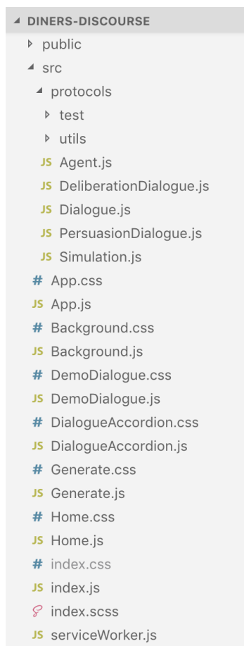
Fig. 2. Project architecture

The project's software architecture is shown in Figure 2 and can also be further examined on its GitHub repository 2 . As can be seen, the front-end is written as modular components, each of which has a distinct purpose within the system and is contained within the src folder, whereas the protocols subfolder contains the back-end files, each of which corresponds to a class in Figure 1. Moreover, the protocols are supported by unit tests under test , which verify the soundness of the implementation, and additional helper files under utils .