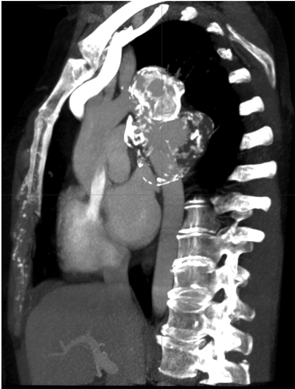
Fig 1. Computed tomography angiogram depicts the aneurysm preoperatively.

The postoperative course was uneventful. Fig 3 shows the control computed tomography image before discharge on postoperative day 10.