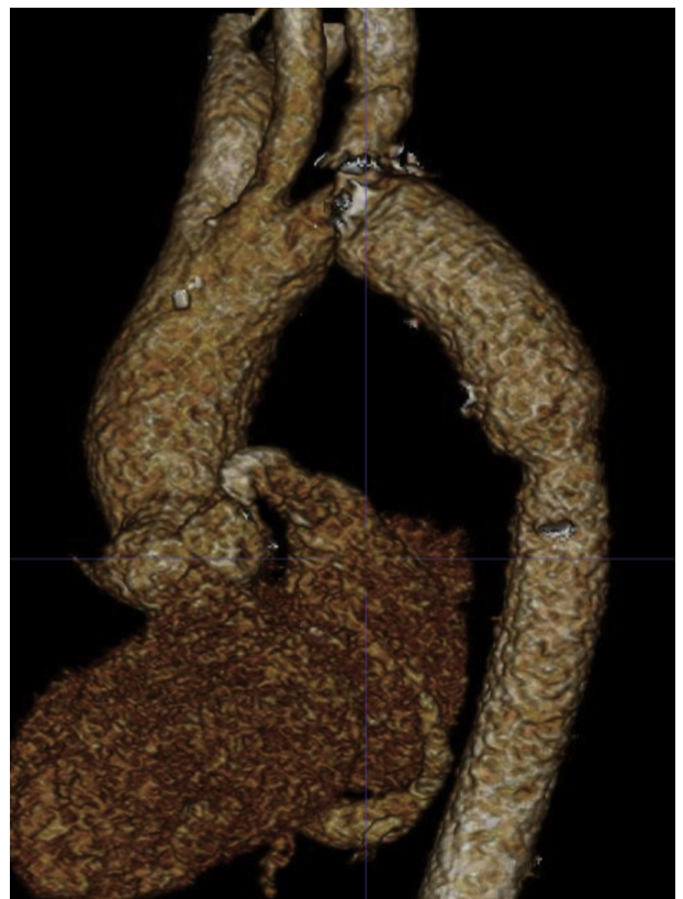
Fig 3. Predischarge three-dimensional computed tomography image shows complete repair of the aneurysm with no extravascular leakage.