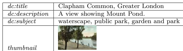
Table 1 Example Europeana item demonstrating the kind and amount of meta-data available to the hierarchy algorithms. The thumbnail image was shown to the users in the evaluation, but is not used by any of the hierarchy algorithms.

We make use of three pieces of information from the Europeana metadata (see Table 1 for an example). The dc:title , dc:description and dc:subject fields that contain textual information describing each item. These fields were chosen since they are more informative than other fields in the meta-data and also tend to have been completed more consistently than other fields by the institutions that provide information to Europeana. 99% of records have a dc:title , 74% a dc:description , and 64% at least one dc:subject value. The dc:title and dc:description provide short pieces of textual information about the item. The dc:subject field often links the item to an existing hierarchy, but not all providers have done this (i.e. the information is incomplete) and providers have also used a wide range of different hierarchies without documenting which one was used. For evaluation purposes, but not in the hierarchy creation process, we also used the thumbnail images provided by Europeana.