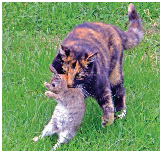
Figure 1. Cat 2, a generalist predator with special preference for rabbits.

(2.0:1.0); lizards (8.1:1.7). For both cats, birds formed about a third of their diet: 33.4% and 34.5%.