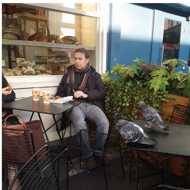
Figure 5. Feral pigeons feeding waiting for spillage of human food (South Kensington, London)