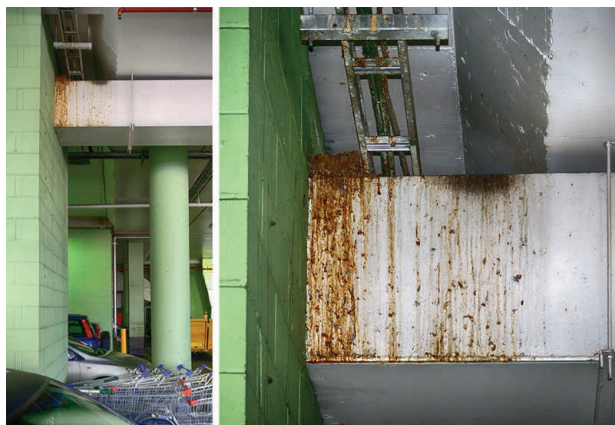
Figure 7. Feral pigeons nesting in the carpark and associated soiling nesting and roosting (Westfield Shopping Centre, Parramatta, NSW)