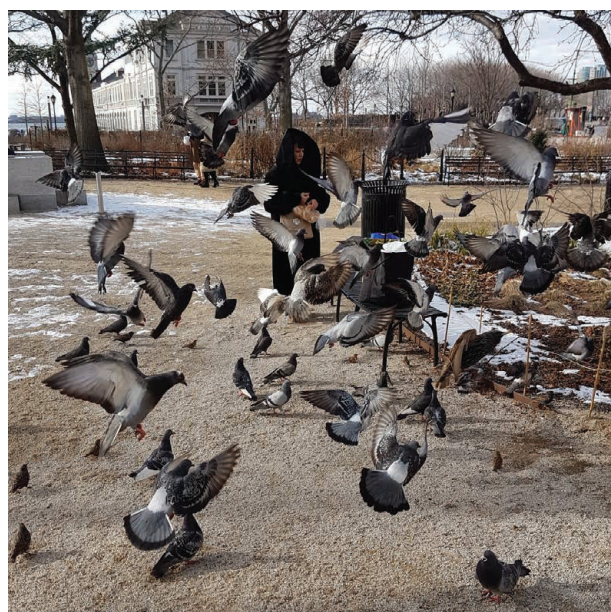
Figure 4. Volunteer food (bread) offered to feral pigeons by a member of the public (Battery Point, New York)