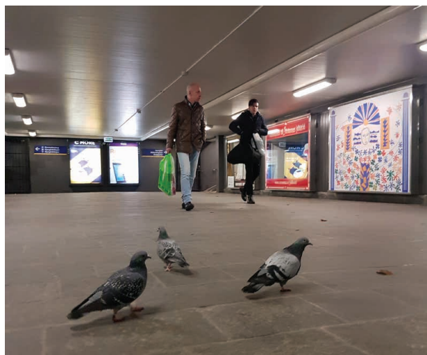
Figure 1. Feral pigeons one level below ground (Tunnelbana Station Centralen, Stockholm)

This paper has reviewed and summarised the current knowledge of various physiological and metabolic factors that influence the acidity of excreta in feral pigeons. Physiological factors that can influence excreta are the bird’s age and sex, and for females, whether they are in the egg-laying stage. While significant, the observed differences are of a smaller magnitude on faecal pH than the influence of diet. Natural, grain and pulse-based foods are less acidic (by an order of 2 pH incre-