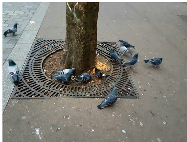
Figure 2. Feral pigeons feeding on discarded human food (Porte de Vanves, 14ème arrondissement, Paris) (Photo Dirk HR Spennemann January 2017)