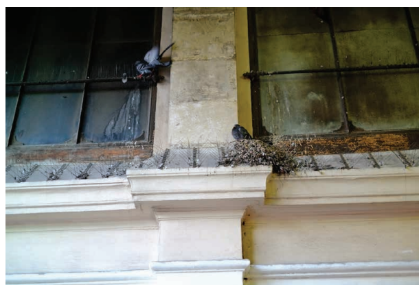
Figure 8. Feral pigeons nesting despite pigeon spikes (Passage Vendôme, 3ème arrondissement, Paris)