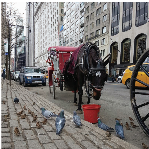
Figure 3. Feral pigeons and domestic sparrows feeding on animal food spillage (Central Park, New York) (Photo Dirk HR Spennemann January 2017)