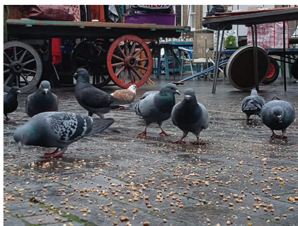
Figure 6. Feral pigeons feeding on volunteer food (Bermondsey Markets, London)

ments) than human, processed foods. The documented high individuality of the birds, their food preferences, as well as the variable nature of accessible food sources results in a high variability of the faecal pH. Once voided, the external factors, such as leaching by rainwater as well as colonisation by bacteria and fungi, change the acidity levels. This too is not uniform but dependent on relative humidity, temperature and available sources of fungal spores.