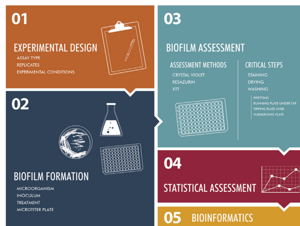
Fig. 1. Schematic diagram of the guideline and critical steps for spectrophotometric and fluorometric methods of biofilm assessment. Schematic diagram of the different sections of this guideline, highlighting the various critical steps that can increase variability in biofilm experiments. Different approaches to washing were illustrated to showcase how variable these can be in different protocols. (Illustration courtesy of Jill Story).

This guideline focuses on spectrophotometric and fluorometric measurement of biofilm grown in microplates and is divided into 5 different sections labelled 01–05 (Fig. 1). Although there may be minor differences between staining reagents and techniques, this outline is designed to follow the chronological order in which the assays are typically performed and described. Section 01 pertains to the experimental design.