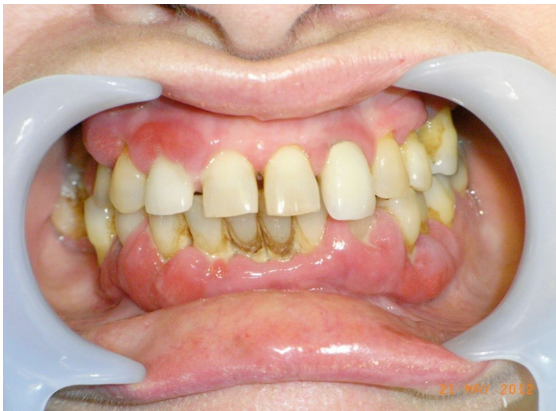
Figure 1: Patient at presentation. Note increased plaque buildup UR quadrant compared to UL.

A plaque score aims to quantify the presence/absence of plaque on buccal, lingual/palatal and interproximal surfaces of all natural teeth. It is usually expressed as a percentage of all such scorable surfaces of teeth, and can be used as an indicator of levels of home care. Plaque score is also used as a patient motivator as well as a guide to providing tailored oral hygiene instructions (OHI). For example, the patient in figure 1 demonstrates increased levels of plaque build-up in the upper right (UR) quadrant and less so in the upper left (UL) quadrant. This patient can be congratulated on achieving a good result in the UL quadrant and use this to motivate improve oral hygiene in the UR quadrant.