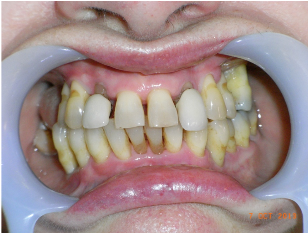
Figure 5. Patient from Figure 1 following 18 months of maintenance therapy.