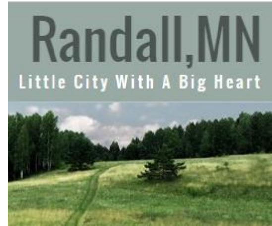
Randall City Website - http://www.randall.govoffice2.com/