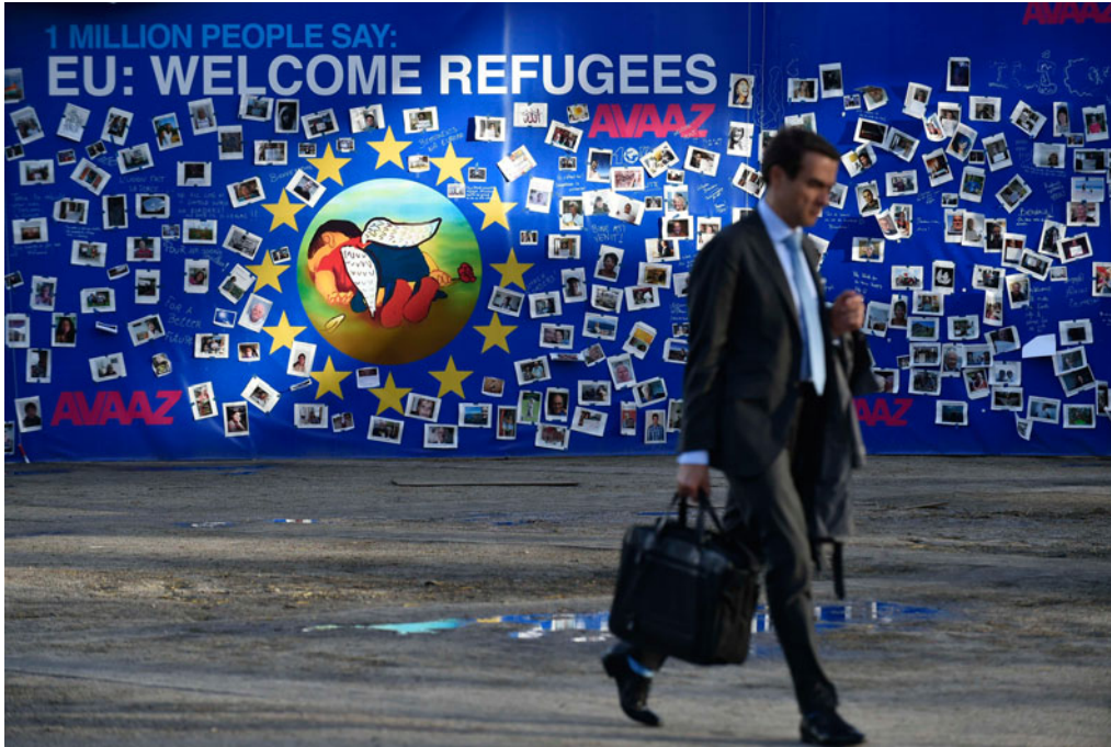
Figure 2. The Wall of Welcome at the Schuman Roundabout square in Brussels, in front of the EU headquarters, 14 September 2015.