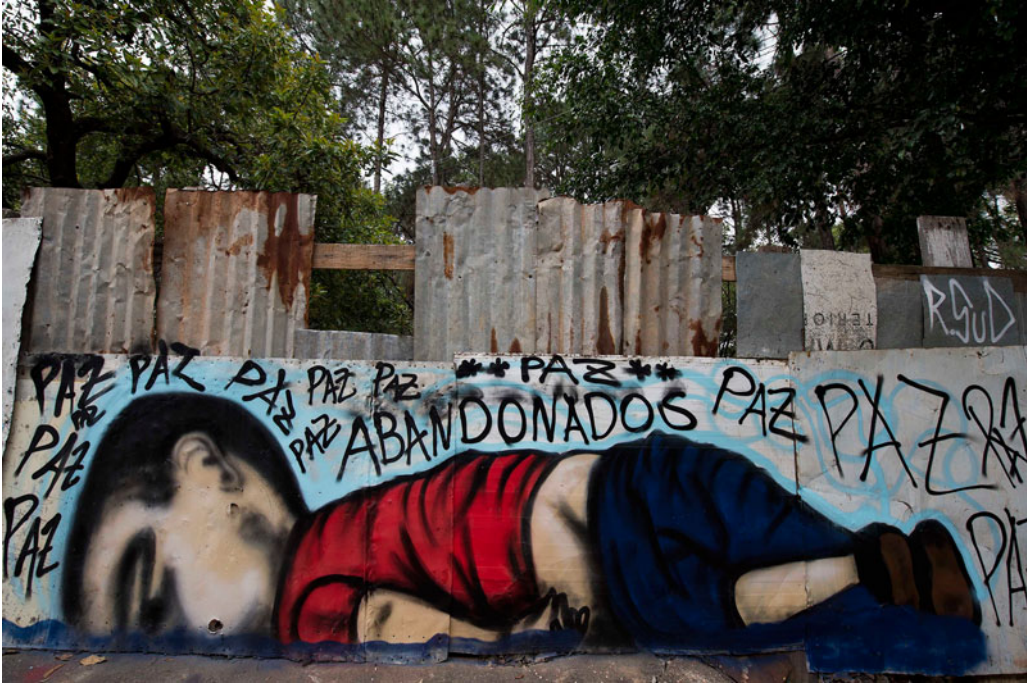
Figure 1. A mural in Sorocaba, ninety kilometres from Sao Paolo, Brazil, 6 September 2015.

of context, in the form of an angel or sleeping in a child's bedroom. 71 It is worth noting though that those less overtly political mediations were in some cases applied to make explicitly critical-political statements. For example, the global civic society organisation Avaaz used the frequently circulated motif of Alan Kurdi as an angel in a Wall of Welcome located right in front of the European Union headquarters in Brussels (Figure 2). Thus while these remediations of 'Kurdi' can be separated into different analytical categories, for example those that decontextualise or recontextualise the figure of Alan Kurdi when the photographs were circulated, seen and (re)used we see a process of emotional bundling as mediations are connected across those analytical categories. 72