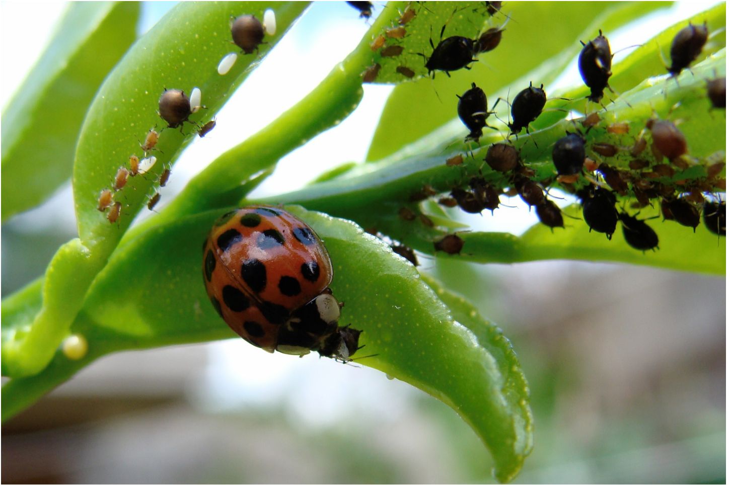
Fig 1. A specimen of Harmonia axyridis observed in Costa Rica.

https://doi.org/10.1371/journal.pone.0220082.g001