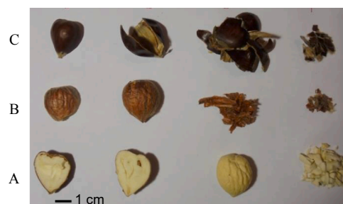
Fig. 1. Fruit (A), inner (B) and outer (C) shells of the analysed chestnuts.

PIXE measurements were performed at CTN/IST (Portugal), at the