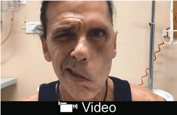
Video Graphic 1. See video, Supplemental Digital Content 1, which displays preoperative view of the patient affected by long-standing facial paralysis, http://links.lww.com/PRSGO/B83 .