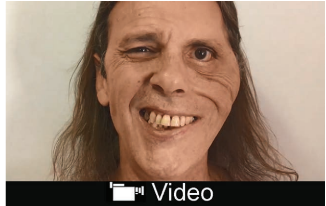
Video Graphic 2. See video, Supplemental Digital Content 2, which displays postoperative view at 1.5-year follow-up, http://links.lww.com/PRSGO/B84 .

ipsilateral cupid bow on the affected side and the length of the zygomatic arch, respectively.