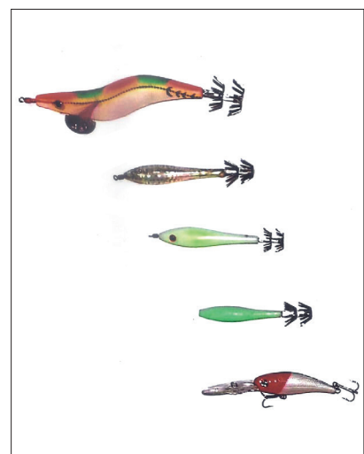
Fig.5. Jigs varieties used by hand jiggers