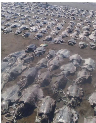
Fig. 3. Landings of Pharaoh cuttle fish

The oceanographic parameters retrieved from satellite data sea indicated that Sea Surface Temperature (SST) was in the range of 29-30°C during abundant catch of cephalopods. Mid-column (10-15m depth) temperature was 28°C. Sea surface height above geoid (SSH) increased from 20 cm to 44 cm during abundant catch period and the SSH anomalies may be influenced by ocean circulation also. Fishermen reported increased sea water currents during abundant catches and told that they never observed such high catch in last 2-3 decades. The Indian squid reportedly forms large congregations in inshore waters during the spawning season at which time they are caught by purse seiners using lights.