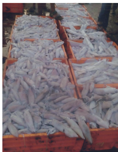
Fig. 4. Landings of Indian squid