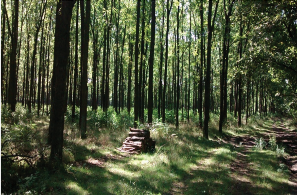
FIGURE 2. Black walnut plantation at the age of 60 years in Central Hungary

circumstances should livestock be grazed in a black walnut plantation. They will eat young trees; the bark of older trees may be stripped and soil compaction will reduce walnut growth. Deer and rabbits can provide forest owners with enough problems caused by animals [2, 6].