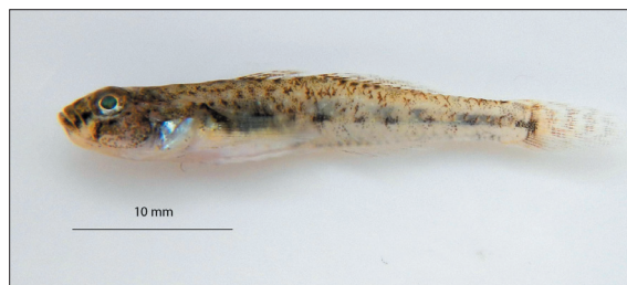
Fig. 2. A specimen of Pomatoschistus microps sampled in the River Asinaro (Ionian Sea)

Morphological, meristic and color pattern analysis allowed us to identify the species as P. microps . The two specimens measured 32 and 35 mm (Fig. 2) in total length (TL). The bottom of the river was sandy and covered by green algae and dead leaves of Posidonia oceanica . Amphipods of the family Corophiidae, known to be one of the main preys of this species (MILLER, 1986), were found among the bottom vegetation. The species was quite elusive and difficult to catch with hand net. In the same and following days, several specimens (>10) were observed in the same location (estuary of the River Asinaro).