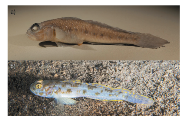
Fig. 1. Lesueurigobius friesii: a) single male, 56.8+17.0 mm, PMR VP4366, b) one of observed additional specimens, both at Eidsfjorden, south-east of the town Sogndal in Sognefjorden, Norway.

Material collected (standard length+caudal fin length): single male, 56.8+17.0 mm, PMR VP4366, Eidsfjorden, south-east of the town Sogndal in Sognefjorden, Norway (61°12'5.9" N, 7°10'6.6" E), 24th July 2018, collector R. Svensen (Fig. 1a). Species diagnosis: (1) sub-