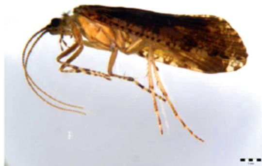
Fig. 5. Agrypnia varia (Fabricius, 1793) male, from Lake Njivice, island Krk. (scale bar = 2mm)