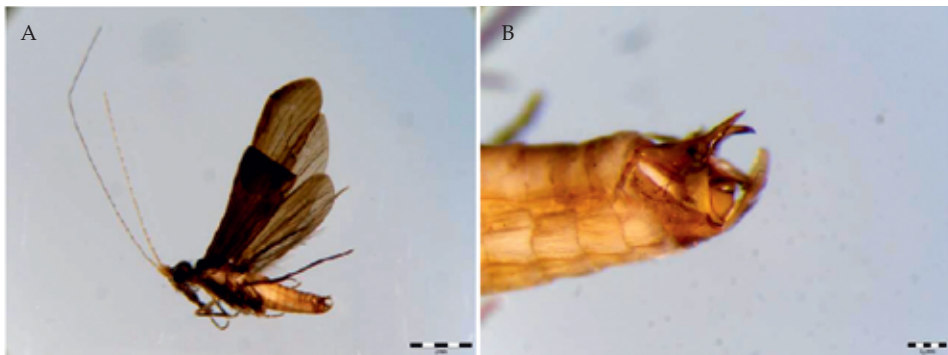
Fig. 6A-B. Mystacides azurea (Linnaeus, 1761); male (A), zoomed male genitalia (B) from Lake Njivice, island Krk. (scale bar = 2mm)

Lake Njivice, island of Krk, 1.07.2015, 1 male