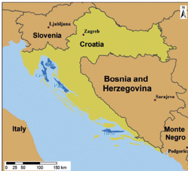
Fig. 1. Map of Croatia with the investigated islands in blue color (Cres, Krk, Pag and Hvar).

The collecting of material was done during 2015 and in August 2018. Islands Krk, Cres and Pag were visited in the spring, summer and autumn of 2015 for a total of 15 field days. The island of Krk was visited also in August 2018. On the island of Cres the material was collected at Vransko Lake (Fig. 2C) and in the pool near the village of Beli; on Krk it was collected at the lakes Njivice and Ponikve (Fig. 2B); and on Pag at Lake Veliko Blato (Fig. 2A) near the town of Pag. During the field work we collected mainly adults, which can be identified to species level, and only on Pag were a few larvae collected (leg. G. Lukač, M. Kučinić). Adults were collected during the day with entomological nets during 30 minute catch per unit effort (CPUE) periods, and during the night with a small portable light traps equipped with UV lamps of 12 V voltage power (lighting time = 60 minutes). All collected specimens were preserved in 96% ethanol in order to be available for DNA barcoding of selected species. The majority of collected Trichoptera specimens are now a part of the Collection NIP – Trichoptera in the Croatian Natural History Museum in Zagreb.