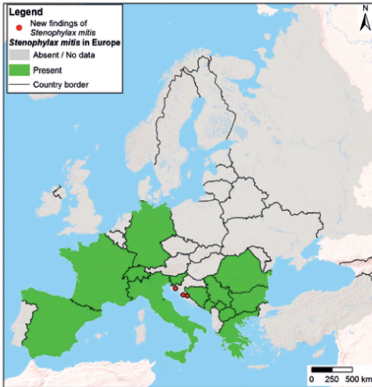
Fig. 3. Distribution of Stenophylax mitis McLachlan, 1875 in Europe according to FAUNA EUROPAEA (2019) with records in Croatia.

islands, listed in the Barcode of Life Data System (BOLD) (RATNASINGHAM & HEBERT, 2007). DNA barcoding method confirmed morphological identification of caddisflies species from Croatian islands based on sequences deposited in the BOLD database. Sequences analysed the using BOLD identification engine, were matched for their maximum identity with those available in the BOLD database (maximum similarity 99%).