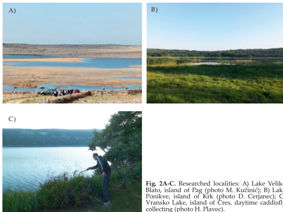
Fig. 2A-C. Researched localities: A) Lake Veliko Blato, island of Pag; B) Lake Ponikve, island of Krk; C) Vransko Lake, island of Cres, daytime caddisfly collecting.