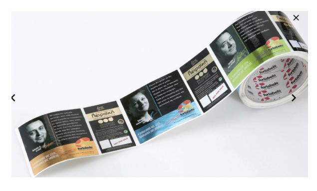
Figure 3 Hybrid printing and Variable data printing technology

Variable and mosaic technologies allow to create collectible packaging to commemorate an event, personalized packaging for a specific consumer providing even personal bits such as his photo, packaging with an educational purpose that may display recipes, information about the product's place of origin, etc., as it can be seen in image 3 at beer labels.