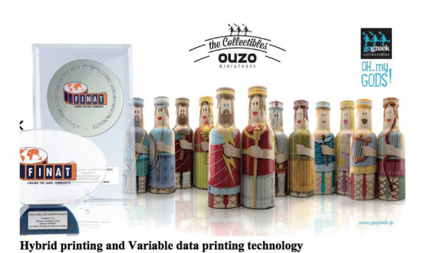
Figure 1 Ouzo shrink-sleeve labels

Thus, twelve different labels, corresponding to the twelve Gods of Olympus, were created, with shrink sleeves dressing miniature ouzo-bottles as illustrated in image 1 [6].