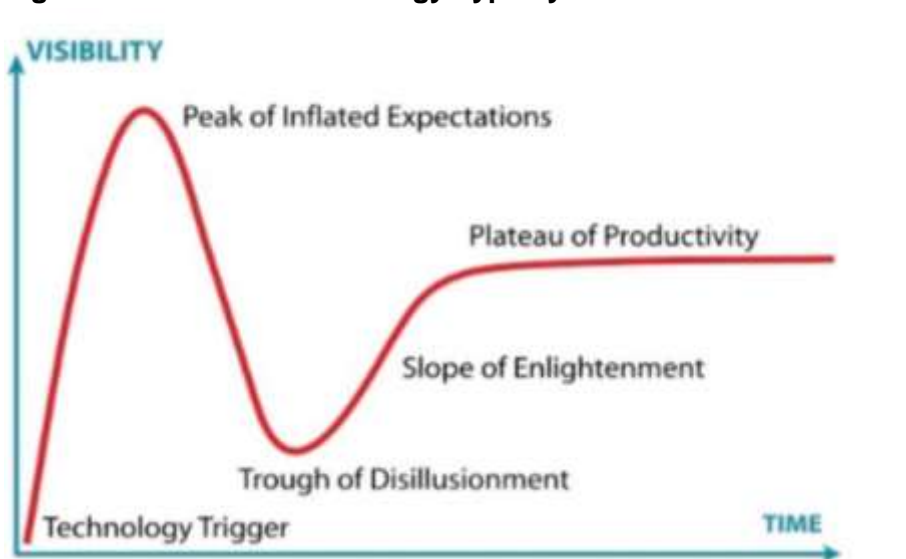
Figure 1.1 Gartner’s technology hype cycle