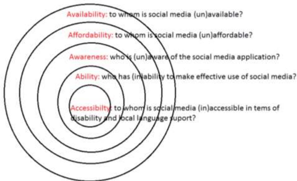
Figure 2.1 Social media access: the five 'A's