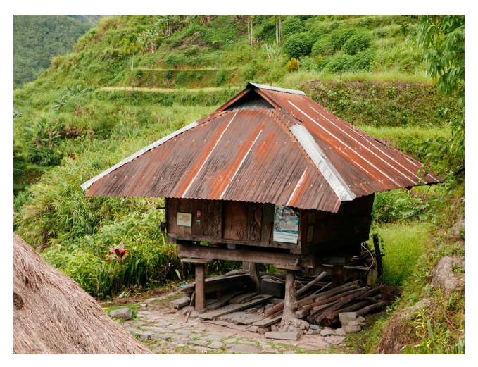
Figure 7. Traditional Ifugao house/granary on stilts.