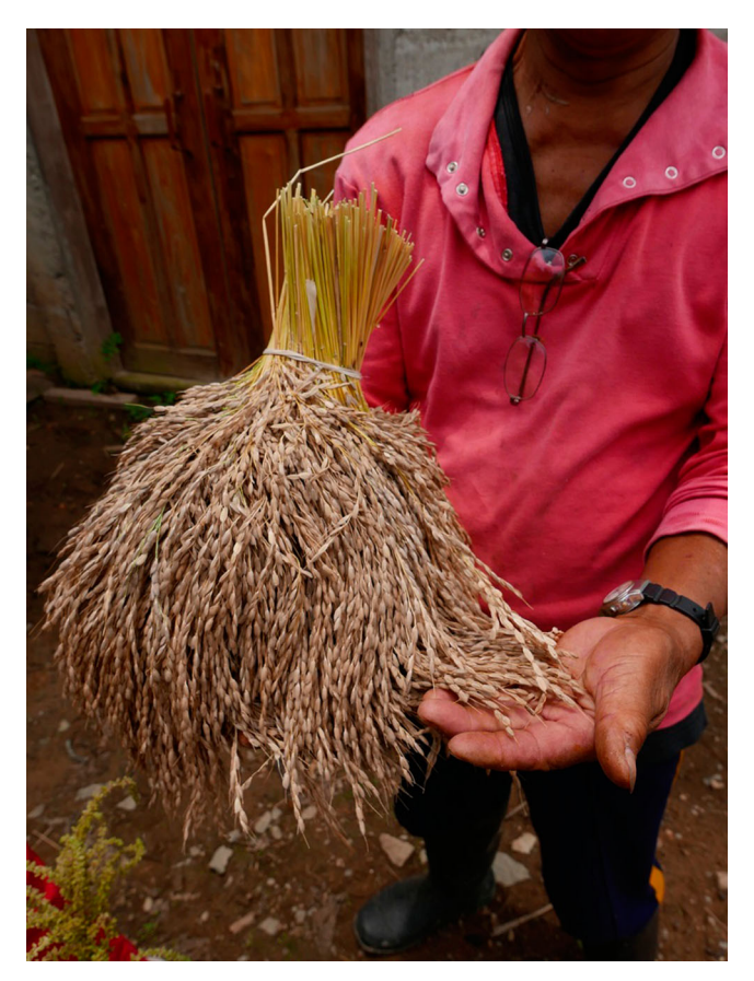
Figure 6. Typical bundle of harvested tinawon rice.