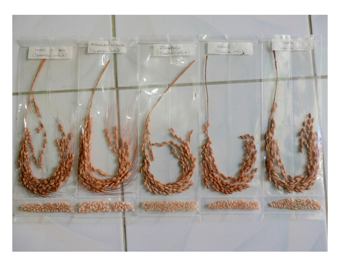
Figure 5. Several tinawon rice varieties classified by the Cordillera Heirloom Rice Project (CHRP) as Tinawon White (l to r): Inawi w/ awn [hairy]; Imbu'ucan w/ awn [hairy]; Isamfulo ; Inawi [hairless]; Dona'al .

enterprise, in spite of potential differences in their perspectives, interests and understandings (Star and Griesemer 1989). The heirloom concept also reifies and purifies a fluid, dynamic and contextual set of local meanings and categories into a neat, legible, standardised category of tinawon heirloom rice, enabling this locally rooted object to travel beyond Ifugao and the CAR.