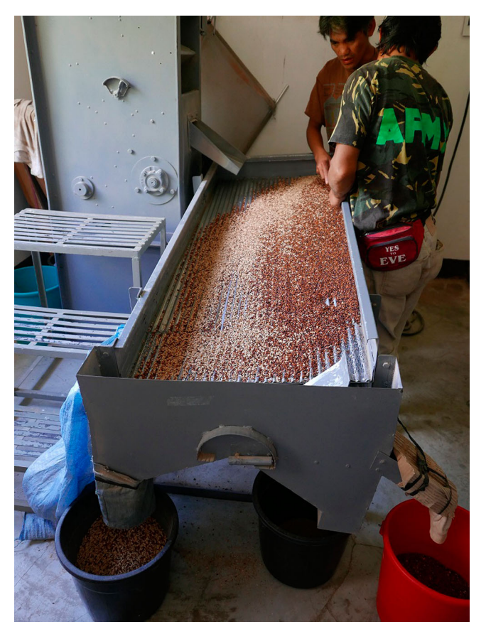
Figure 10. The Rice Terrace Farmers' Cooperative (RTFC) rice mill, Banaue.