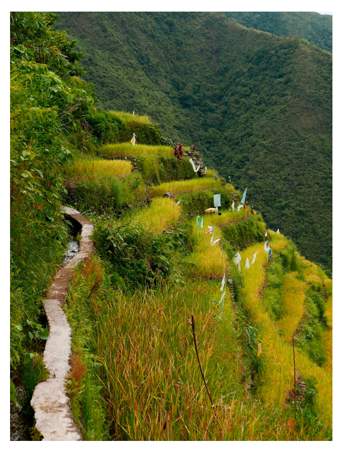
Figure 3. Steep, narrow rice terraces in Batad, Ifugao.