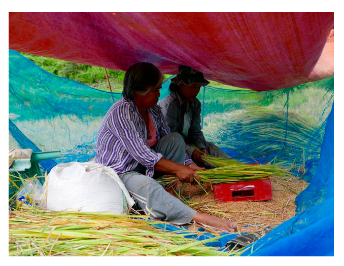
Figure 9. Women threshing rice by hand.