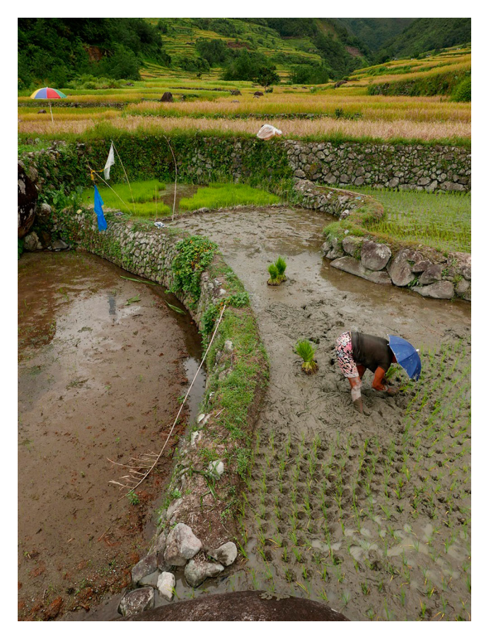
Figure 4. A woman transplants a new lowland variety in Hungduan. Note that mature rice in surrounding fields is waiting to be harvested.

who insisted that Oklan was always white and others who said that they planted a red Oklan ( Oklan Mina'angan ).<sup>13</sup> To some extent, the confusion of names reflects the real profusion of diverse and non-uniform varieties found in the highland areas. For example, rice varieties that seem to be related may come in hairy and hairless types that are easy to distinguish in the field, for obvious reasons, but once the hulls have been removed from the grain it may take deep expertise to see a difference between their grain sizes, shapes or colours (Figure 5).