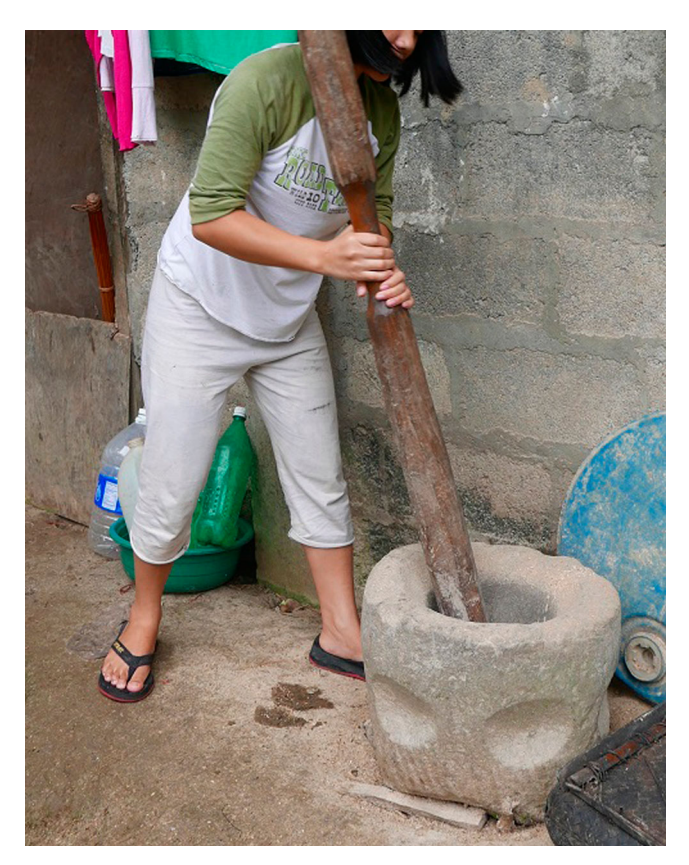
Figure 8. Young woman pounds rice by hand.