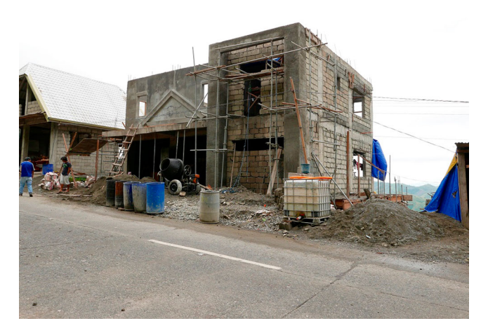
Figure 11. Construction work on new premises for the Rice Terrace Farmers' Cooperative (RTFC), located on the road south of Banaue towards Lagawe. Photo credit: Dominic Glover.

Figure 10. The Rice Terrace Farmers' Cooperative (RTFC) rice mill, Banaue. Photo credit: Dominic Glover.