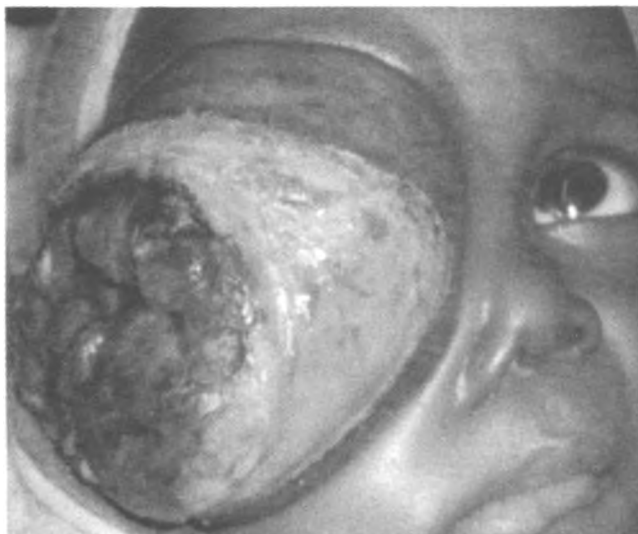
Figure III: Picture showing local progression of disease six weeks after commencing chemotherapy.