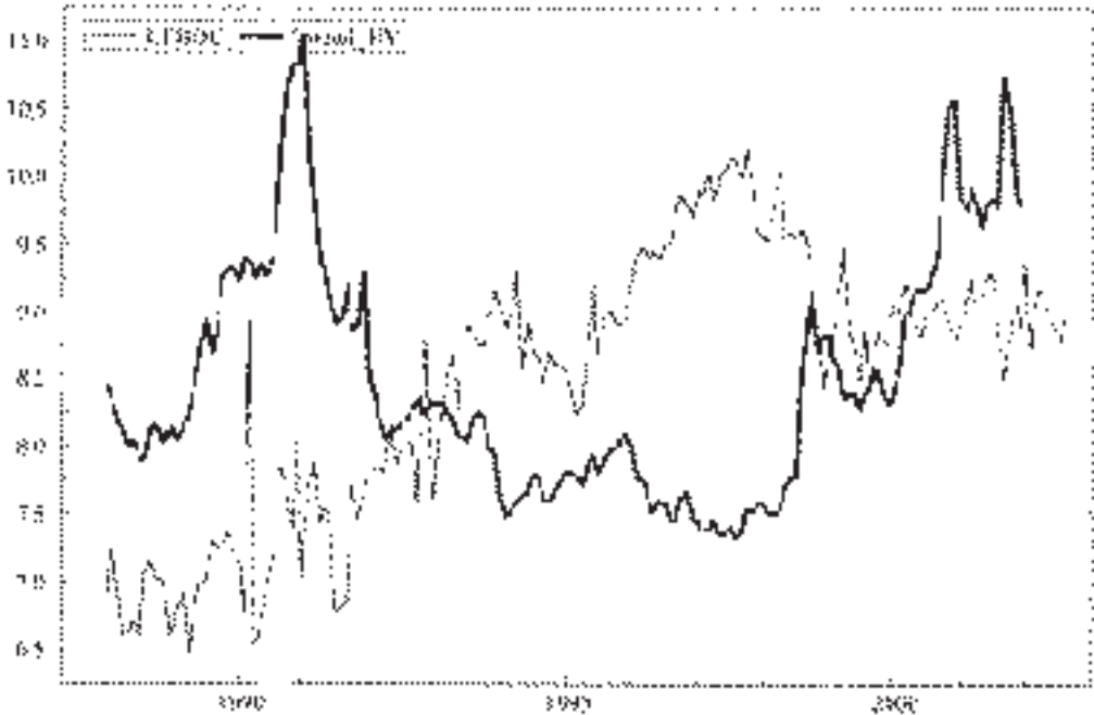
Figure 2: US Gross Purchases of Developing Country Bonds (LTBDC) and US High-Yield Spread (Spread_HY) between 1987 and 2002

Note: LTBDC in logarithmic form, and Spread_HY in per cent.