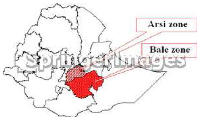
Fig.2 location of Arsi

Industry in the woreda includes 38 small-scale industries employing 93 persons, which include 38 grain mills. Other commercial activity consists of 1160 registered businesses of which 32.8% are wholesalers, 42.2% retailers and 19% service providers. There were 28 Farmers Associations with 15,116 members and 10 Farmers Service Cooperatives with 14,471 members. Robe has 75 kilometers of feeder roads, [3] 36 kilometers of dry-weather and 44 of all-weather road, for an average of road density of 117 kilometers per 1000 square kilometers; 54 kilometers of rural road are under construction. About 19.5% of the total population has access to drinking water; a water supply project is under construction.