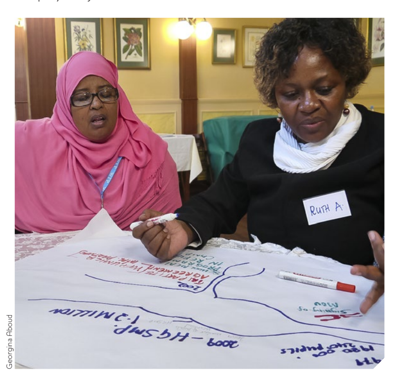
BELOW WFP staff participating in PAL workshop activity in Kenya.

It is not only WFP which does not cost gender mainstreaming properly – donors can also be guilty of this. Although many of WFP's donors prioritise gender, they are not always willing to commit the level of resources needed. However, there are exceptions which provide valuable lessons on how to do things differently. The Canadian government has been instrumental in supporting WFP's Guatemala's efforts on gender, most recently with a major new programme under the SUN initiative with gender as one of three headline themes. In this programme around a third of the budget is assigned for gender-related activities, giving the gender specialist substantial scope for expanding her work and influence across the project cycle.