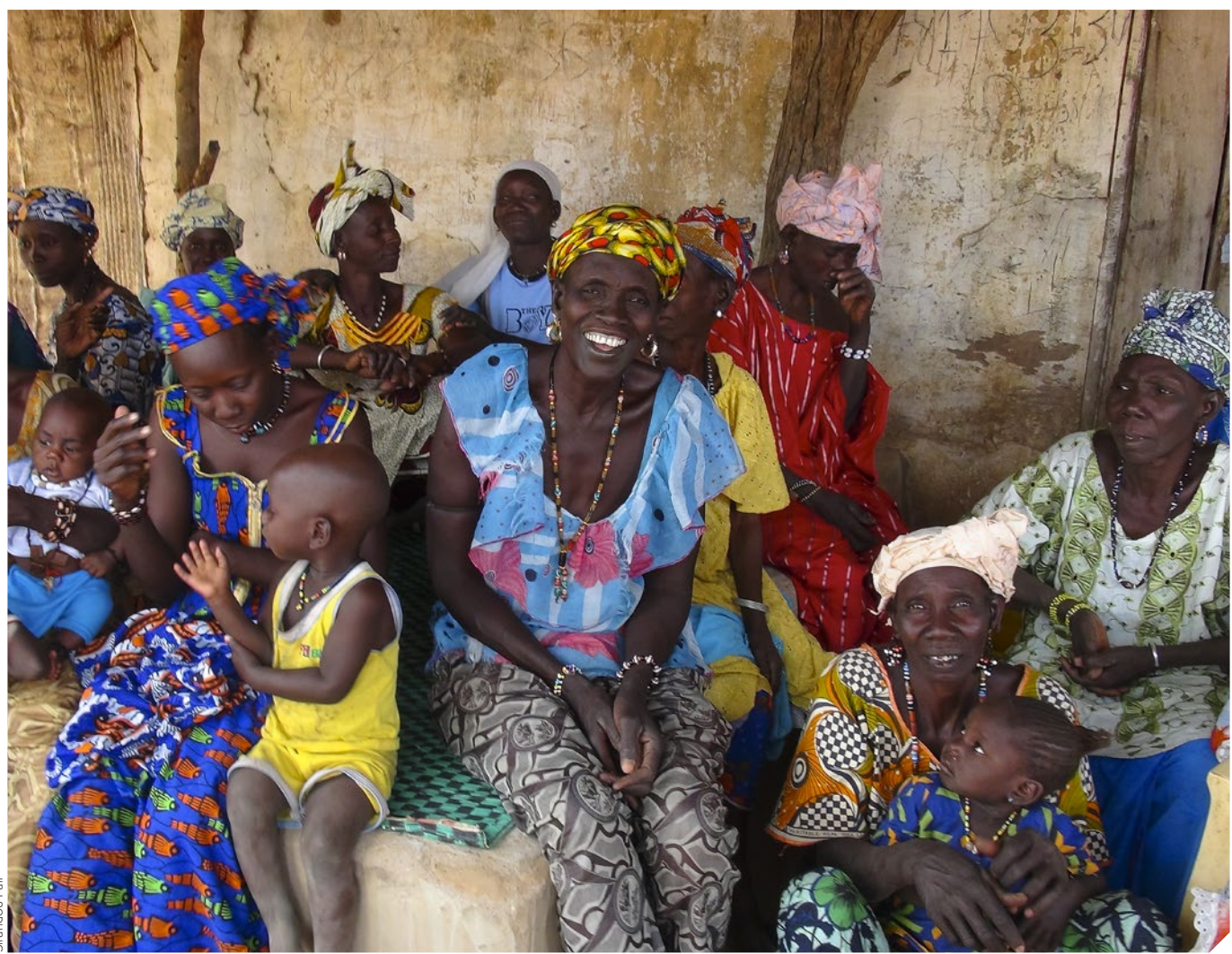
Women involved in R4 activities in Senegal.

Women's participation in farmer's collectives (both single and mixed sex) and other types of groups can contribute to their empowerment in multiple ways.