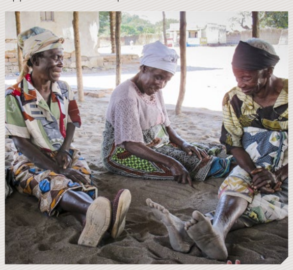
Female focus group discussion in Mangochi district, Malawi. A woman explains to others how she and her husband make a budget with the cash assistance from WFP.

The process has informed the approach to the upcoming relief response for 2014/15. The Malawi office has committed to conducting another study to build on the research in 2013-14 as a way to continue making their emergency response more gender-sensitive and build on potential opportunities to empower women.