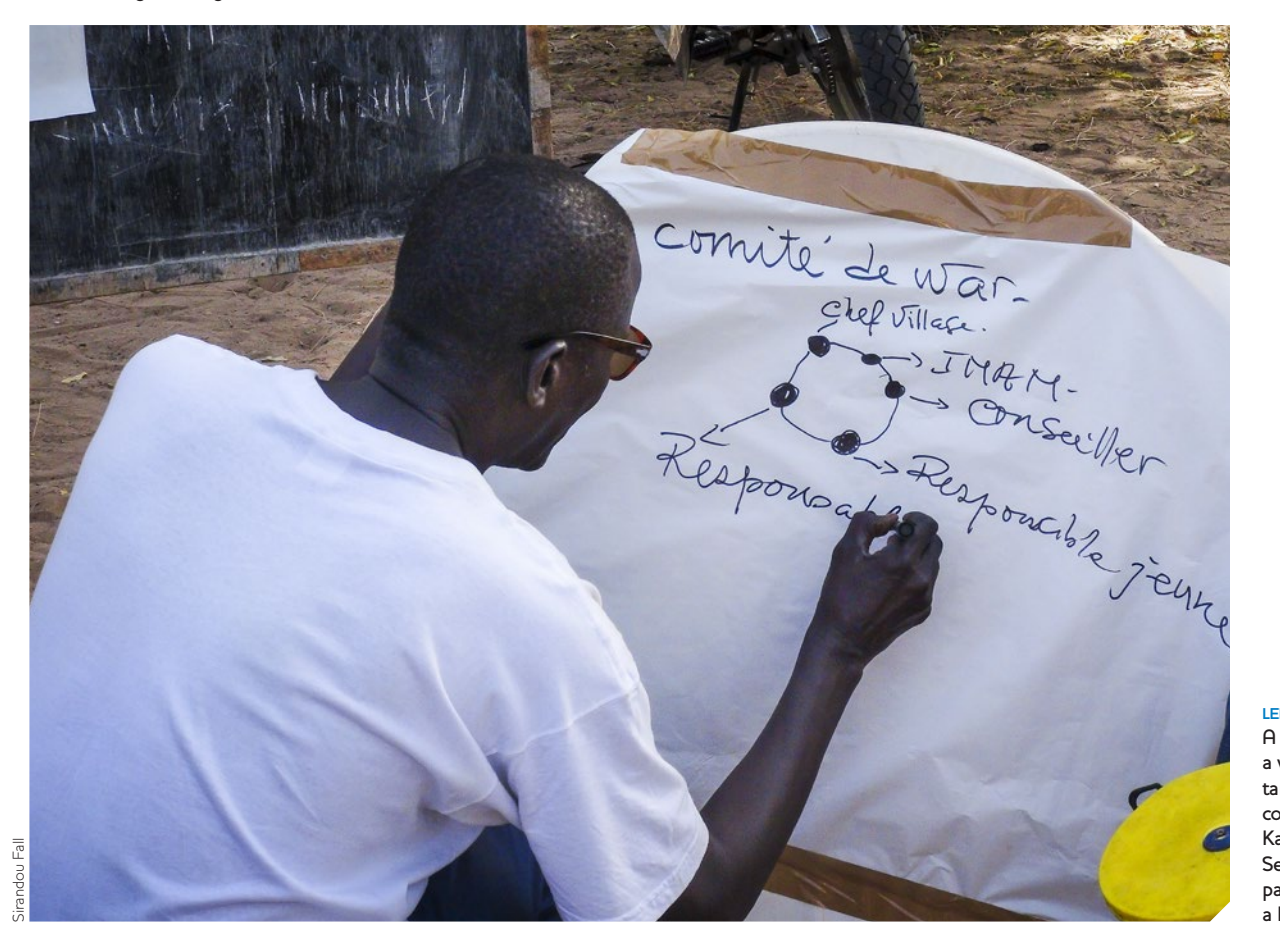
LEFT A member of a vulnerability targeting committee in Kaolack region, Senegal, participating in a PAL activity.