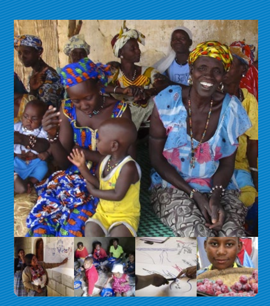
Front cover Clockwise from top: Images from our programmes from Senegal, Malawi, Kenya, Lesotho and Guatemala.