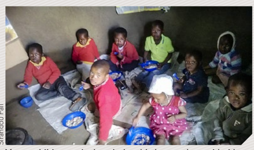
Young children enjoying their mid-day snack provided by WFP at Meeling ECCD in Mokhotlong district, Lesotho.

activities on nutrition and child care, both to strengthen nutrition outcomes and to raise awareness of men's shared responsibility for unpaid care work.