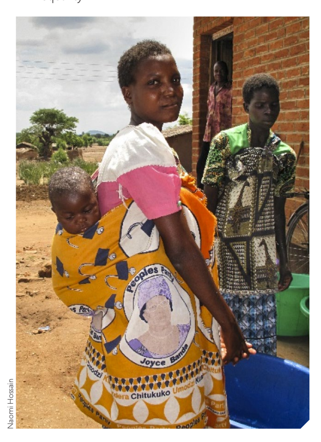
Mother and child at the supplementary feeding centre in Malawi.

Designing interventions: no programme design can be gender-sensitive if it does not take into account how it will impact on lives and gender roles. For example, during the PAL work many examples emerged of programmes which have been designed without taking account of the impacts on unpaid care work, which is widely accepted as one of the foundations of gender inequality.