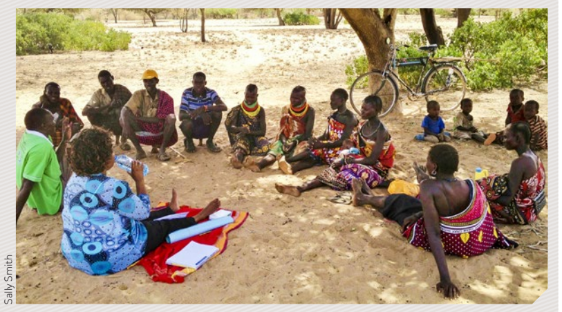
Discussing WFP's Cash for Assets programme with a community in Turkana, north-west Kenya.

Kenya's Innovation Team provides a clear and strong example of a how to create space and time for gender-responsive (or other) programme development. This enables staff to experiment and test new programme approaches, and ensures that there is a systematic approach to learning. To date there has been no major focus on gender, but staff interest has ensured programmes are viewed through a gender lens at all stages of the project cycle. For example the pilot to test a scheme to introduce fresh food vouchers for pregnant and lactating