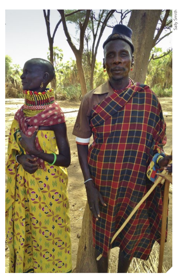
Village elders in Turkana, Kenya, interviewed during PAL study on Cash and Food For Assets.

In addition the policy of targeting women for cash, vouchers and other interventions is premised on stereotyped assumptions about male behaviour, but this was challenged during focus group discussions. Men interviewed in Senegal insisted they if they were given cash or vouchers they would spend the money only on their families and both men and women said it would be easier if sometimes the men were able to come by themselves to collect food and vouchers because of the time and travel pressures on women. Their husbands were usually obliged to come anyway to carry and transport the goods so they were both out of the house for the whole day and had to find childcare, as well as losing a day's work. It was also noted that there were male as well as female savings groups in Senegal, demonstrating men's capacity for financial planning.