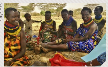
Group discussion with women who are part of WFP's Food For Assets programme in Turkana county, Kenya.

They found interesting differences between the two regions. In the northeast there is a surplus of labour and women find it relatively easy to find someone to replace them when they are ill, pregnant or otherwise unable to work. In contrast, in the coastal region