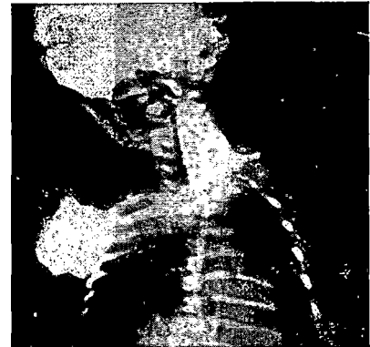
Fig. 1—Oesophageal atresia with proximal blind pouch outlined by radio-opaque fluoroscopy.

Clinically upper abdominal distension develops rapidly after the first 24 hours of life, and straight X-ray of the abdomen confirms the distension of stomach and duodenum up to the point of obstruction. If air is seen in the distal