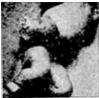
Fig. 4—A six-hour infant with exomphalos, subsequently successfully repaired.