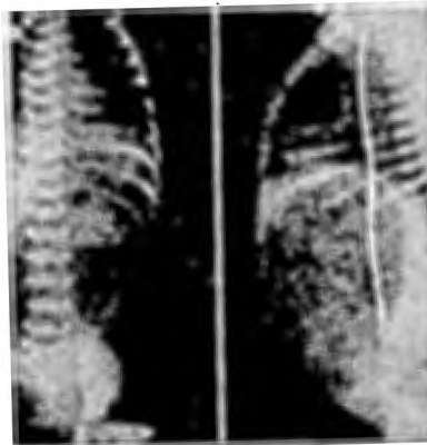
Fig. 3—Duodenal atresia demonstrated by antero-posterior and lateral radiographic views of the infant's abdomen.

(f) Imperforate Anus .—During the first six weeks of foetal life the primitive cloaca drains the intestinal tract and the urogenital sinus. A