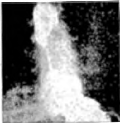
Fig. 6—Barium meal in infant with congenital diaphragmatic hernia with short stenosed oesophagus.

Straight X-ray of the abdomen reveals dilated loops of bowel, and of diagnostic significance in this condition is the variation in the size of the loops as well as the presence of gas bubbles within the meconium masses contained within the dilated bowel. The presence on X-ray of a granular calcium-flecked pattern is evidence of meconium peritonitis.