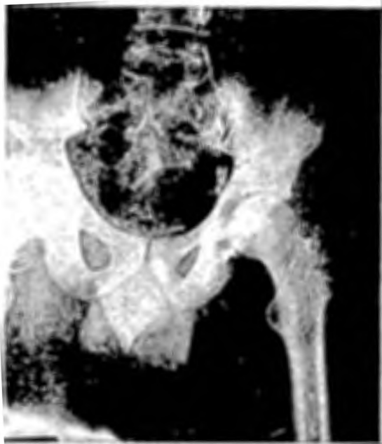
Fig. 3—An on table film of the case in Fig 2 showing incomplete removal of the lymphatic chain necessitating further clearance before completing the operative procedure. Failure to take this film would have resulted in involved nodes being overlooked.

Lymphangiography has only recently been employed in Rhodesia but has been found to be of great use in the assessment, the planning of treatment and the assessment of ultimate clearance of lymph nodes in malignant disease. It is also useful in planning radiotherapy. Experimentally it is a very useful tool to research workers particularly in cancer and as a mode of treatment it may offer great hope to patients when various forms of endo-lymphatic therapy have been better investigated and evolved.