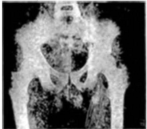
Fig. 2—Lymphangiogram showing enlarged involved inguinal and iliac lymph nodes in a case with malignant melanoma of the left foot.