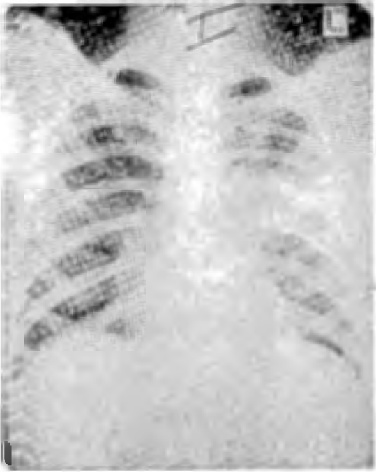
Fig. 3.—The lesion in the left lung extending from the hilum.

nevertheless the wound began to heal and it became very much smaller and without any further therapy the lesion on the back healed completely before the patient's discharge.