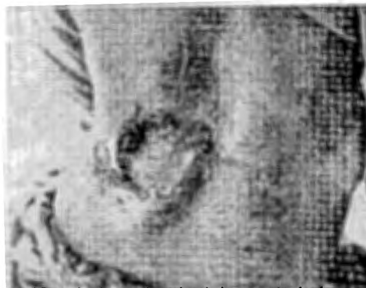
Fig. 2.—Note the large ulcerative lesion on the back.

Although the patient was known to be pregnant it was decided to begin treatment with Amphotericin B. but four days later she aborted and had to have a curettage, the anaesthetic used being flurothane. Following this Amphotericin B. was recommenced, but a week later after a total of 475 mg. had been given the patient was noticed to be jaundiced, the serum bilirubin rising to 18.5 mg% of which 12.5 mg. was conjugated. The alkaline phosphatase only reached 18.5 King Armstrong units. Amphotericin was stopped but