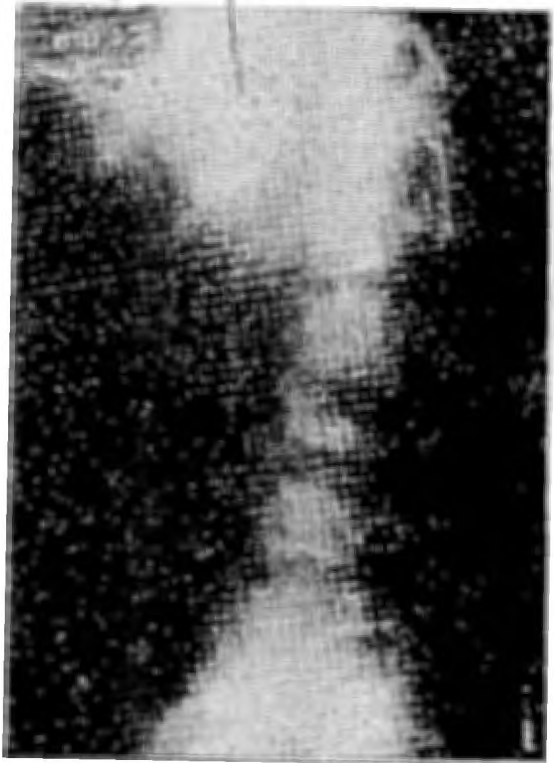
Fig. 1.—This shows the destructive changes present in the third and fourth lumbar vertebrae.