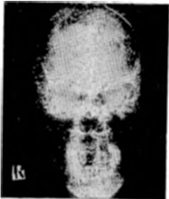
Fig. 5.—Notice the circular areas of destruction in the skull.

to 99° or 100° F. His E.S.R. was 84mm/one hour and haemoglobin 11.9G. Total leucocyte count 10 200.