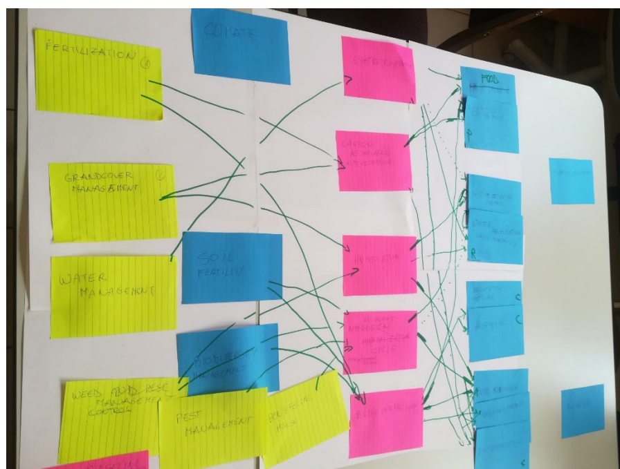
Figure 2 Tools for a participative decision taking in significant environmental parameters to be evaluated, run with Polish farmers and technicians.

Seminars, round tables and a specific section of the questionnaires, translated in all project partners national languages (available at http://www.domino-coreorganic.eu/download/other/Multilingual-questionnaire-on-stakeholder-practices-and-priority.pdf ), were also used to highlight the priorities for stakeholders.