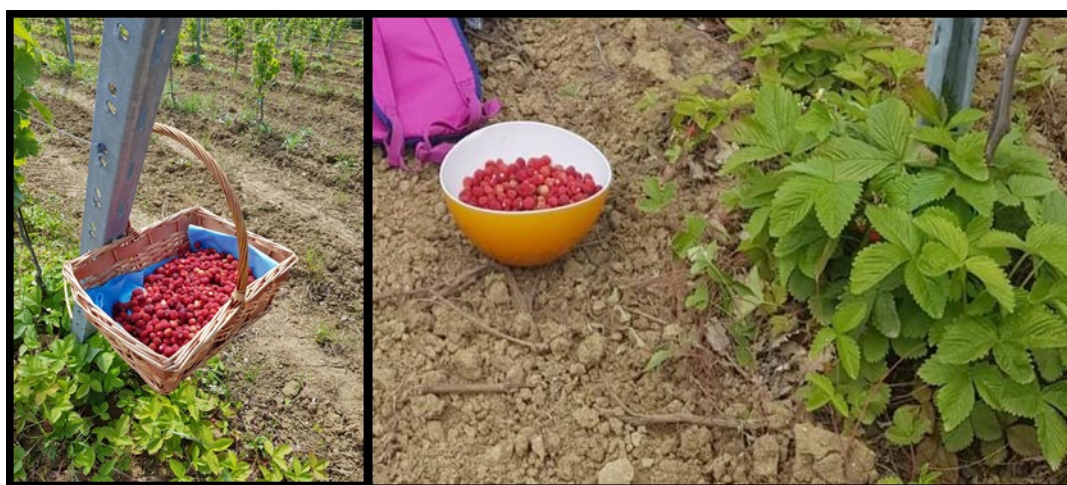
Figure 4 Recreative activities: picking strawberries from mulches at Colle Stefano vinery (IT)

The major outcomes of this activity were thus the guidelines for gathering and assessing data and the initial collection of questionnaires on the perception of the ecoservices provided by the innovation tested by the project. The preliminary analysis of the questionnaire indicated a high consideration of the added value of the living mulches in terms of aesthetic value and marketing claim for farmers selling directly on farm their products. A lower impact was generally estimated as for additional food and raw material production. A relevant exception was represented by farmers able to transform and valorise directly on-farm the secondary products. Organic confitures, produced with the strawberries adopted as living mulches, an herbal teas from strawberry leaves are some of the products sold directly to farm customers. Such products contribute to raise the attention on the multifunctional approach of the alternative soil management strategies (Fig.4).