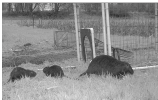
Figure 2. Camera surveillance capture of a nutria ( Myocastor coypus ) social group in the vicinity of a nutria multiple-capture trap (MCT) on Sauvie Island, Oregon, USA, in March 2011; infrared motion cameras were established at each MCT to continuously monitor animal activity from March to April 2011.

2 opossums, 1 skunk ( Mephitis mephitis ), 1 feral cat ( Felis catus ), 1 brown rat ( Rattus norvegicus ), 1 brush rabbit ( Sylvilagus bachmani ), and 1 songbird (species unknown).