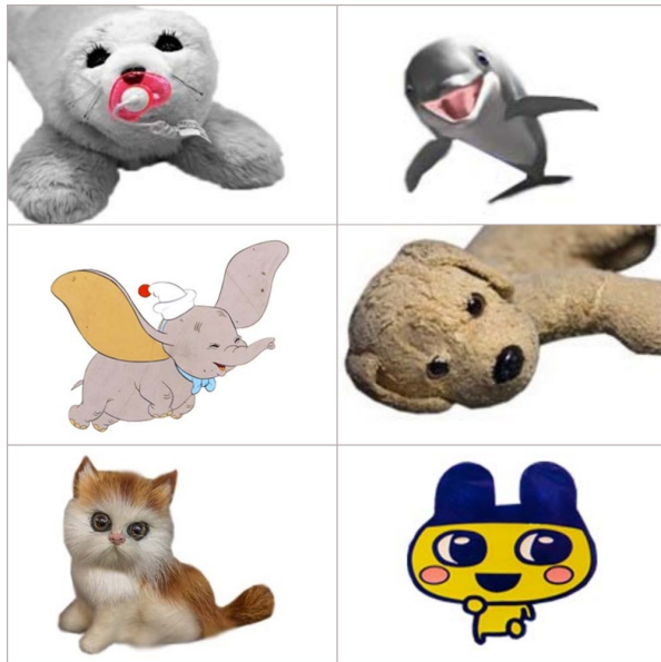
Figure 1. ACs in questionnaire. From top to bottom and left to right: Paro the Seal (1a) [53], Bandit the Dolphin (1b) [35], Dumbo (1c) [54], Dog (1d) [55], Cat (1e) [56], Tamagotchi (1f) [57]

Study protocols were approved by our institutional ethics committee. Thirteen participants provided written consent and one provided verbal consent. Eleven participated in the study on ACs.