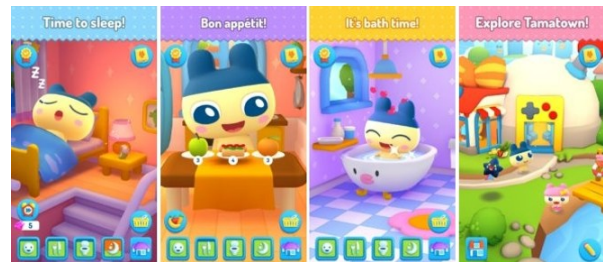
Figure 3. Tamagotchi interactive experience [59]

P3, P4 and P9 stated they liked interacting with a Tamagotchi. P9 said: “it’s cool. Have a lot of fun with that”. Data was missing from one participant due to a lack of internet connectivity during the session.