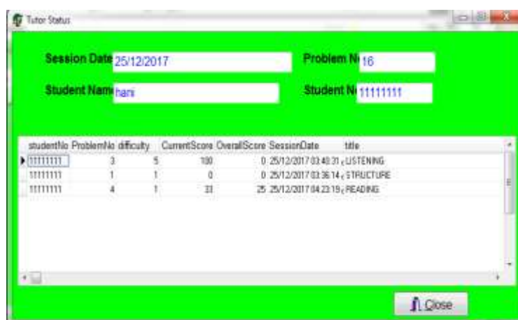
Figure 7: Summary of the scores the learner got so far