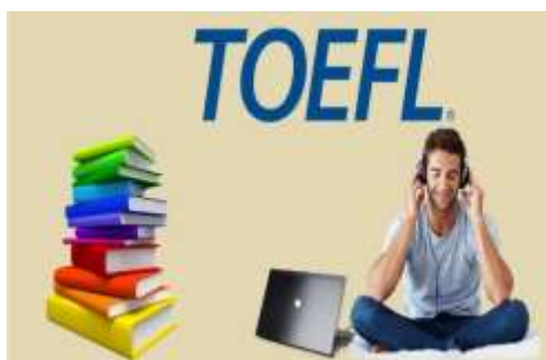
Figure 1: Person practicing for TOEFL exam the traditional way

Intelligent tutoring systems are educational applications of artificial intelligence and machine learning technologies. Intelligent tutoring systems are designed to interact directly with students and perform many of the instructional functions usually reserved for teachers or tutors.