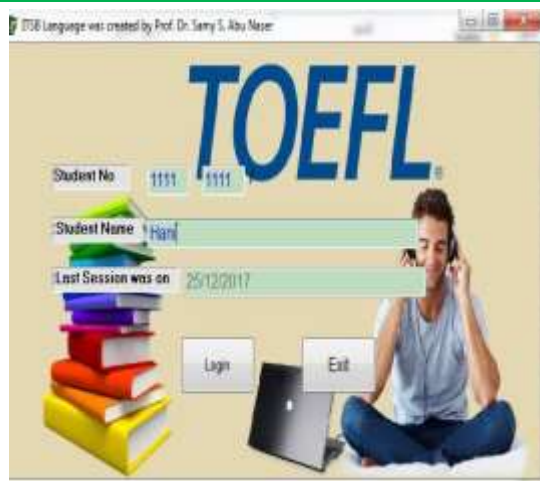
Figure 3: Login Screen