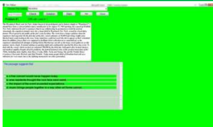
Figure 6: Question Screen without sound