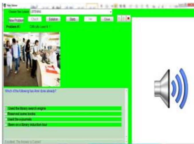
Figure 5: Questions Screen with sound effect