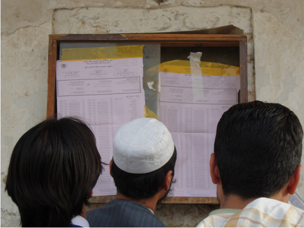
Figure 4: Voters viewing results on the tally form