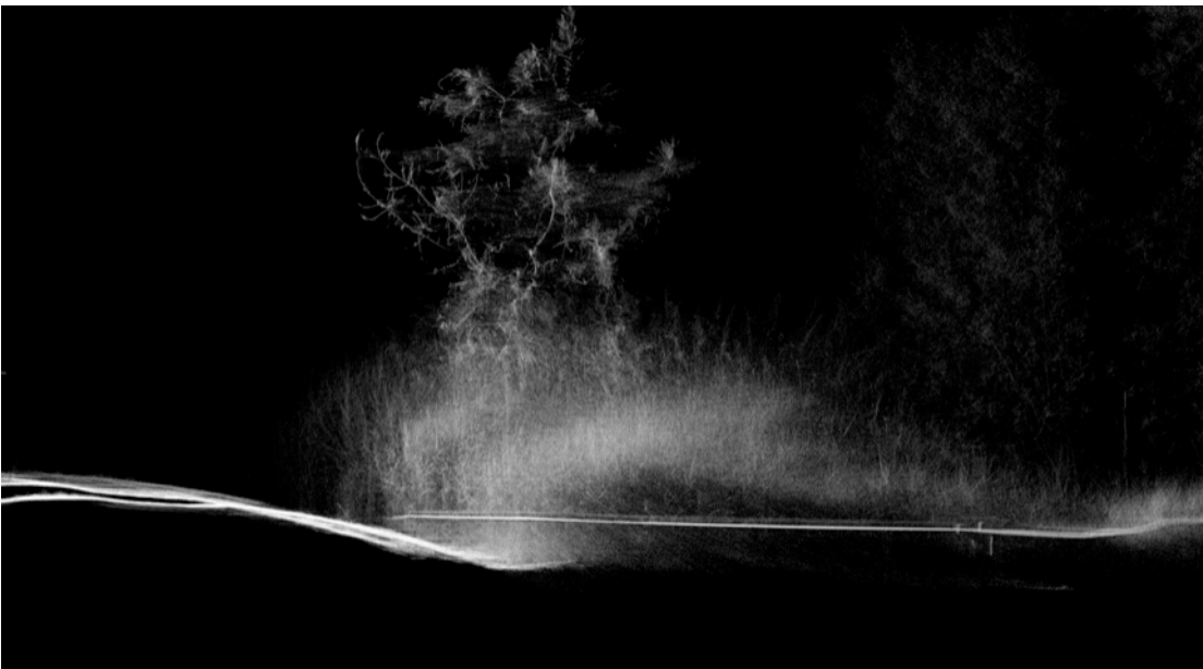
Standing Ash - Intaglio-type Etching 2017

The process of taking the scan data out of the computer and recreating an etching or drawing is key to the works. Captured digital data combines with traditional printing and drawing, resulting in a re-imagined vision linking digital and aesthetic. More widely, I am considering whether we should unconditionally accept and trust digital information presented to us. My images begin as data files, moments in time collected from real locations, the resulting artworks however, are my memory of sensory experiences and personal knowledge as experienced during walking. They are a form of waymarker and not designed to map locations or guide audiences to specific destinations; instead, the viewer is required to bring their own memories to enable a personal journey and complete the story. Matrix of