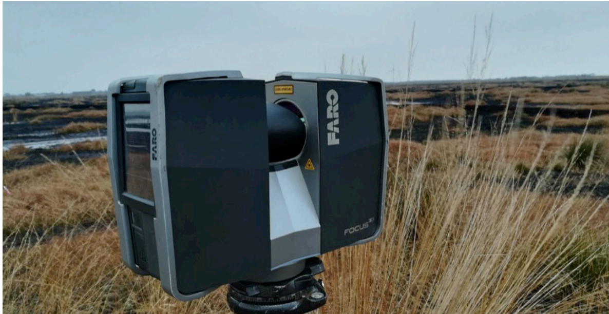
FARO focus scanner on Little Woolden Moss 2018

For me there is an exciting challenge when taking precision equipment and finding alternative uses of its capabilities. Technical collaboration between myself, FARO and science technicians at the University of Central Lancashire has been essential in the development of my projects. Different working methodologies challenged and expanded the possibilities of the equipment and software. Individual skills, curiosity and an enthusiasm to explore new possibilities led to new knowledge. Through this collaborative process came an understanding of how an artist's traditional preoccupation with ethereal qualities and interactions of tonal values could be captured and then translated using digital instruments.