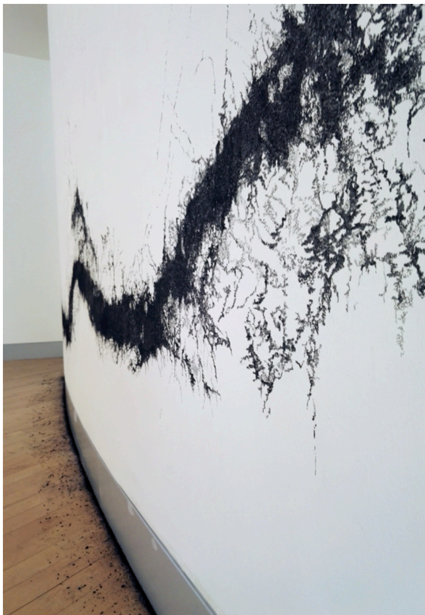
Matrix of Movement – Site specific charcoal wall drawing, The Brindley 2015

Intaglio etching plates are created using acrylic based processes and photopolymer films. These photo-reactive films have been an important development in the printmaking world in the last twenty years. Developed for the circuit board industry, they carry the ability to record and transfer huge amounts of data. For artists the development of these films have enabled the photographic transfer of images onto metal plates without the need for chemical etching, creating surfaces akin to traditional intaglio etchings. The prints are large scale, with single plates often nearly a meter long and extremely labour intensive to print. They are rich in ink and require a constant balancing between depth of saturation of ink on paper with a sense of movement and light.