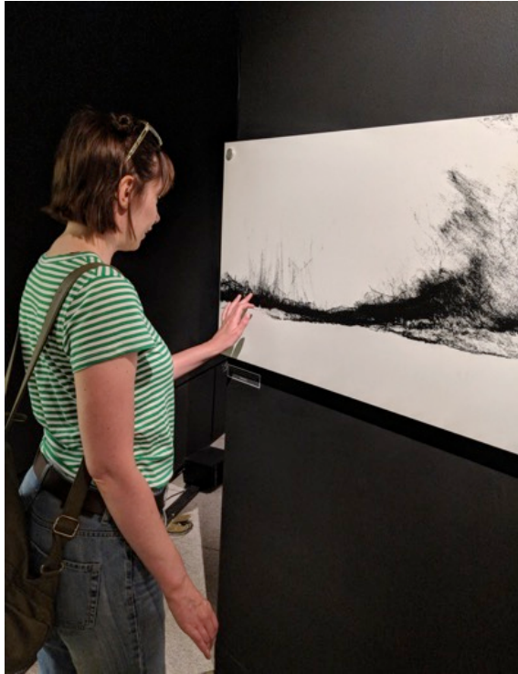
Haeceity – touch responsive screenprints. 2018