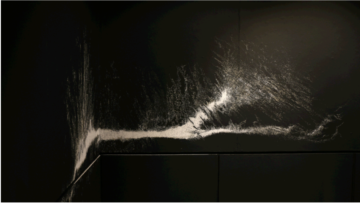
Haecceity – Site Specific wall drawings 2018 Warrington Museum and Art Gallery.

I also created 4 interactive screenprints. The images were printed through silkscreens in a traditional manner, but instead of using normal inks I used conductive ink. This commercially available ink contains fragments of conductive material, which, when dried, allow the conductivity of electricity. The images printed with this ink respond to human touch by conducting the electricity from the hand. When touched, the images triggered sounds recorded while walking on location, transforming the visual into a sonic experience. The recorded sounds were activated through direct contact with the artworks; were necessary in order to gain the experience as captured sounds were played from various points around the gallery – not necessarily from a point closest to the trigger – requiring participation and movement in order to fully engage with the pieces. 7 In this way, the viewer's normal line of vision and behaviour in the gallery was challenged, through a combination of senses, experience and memory.