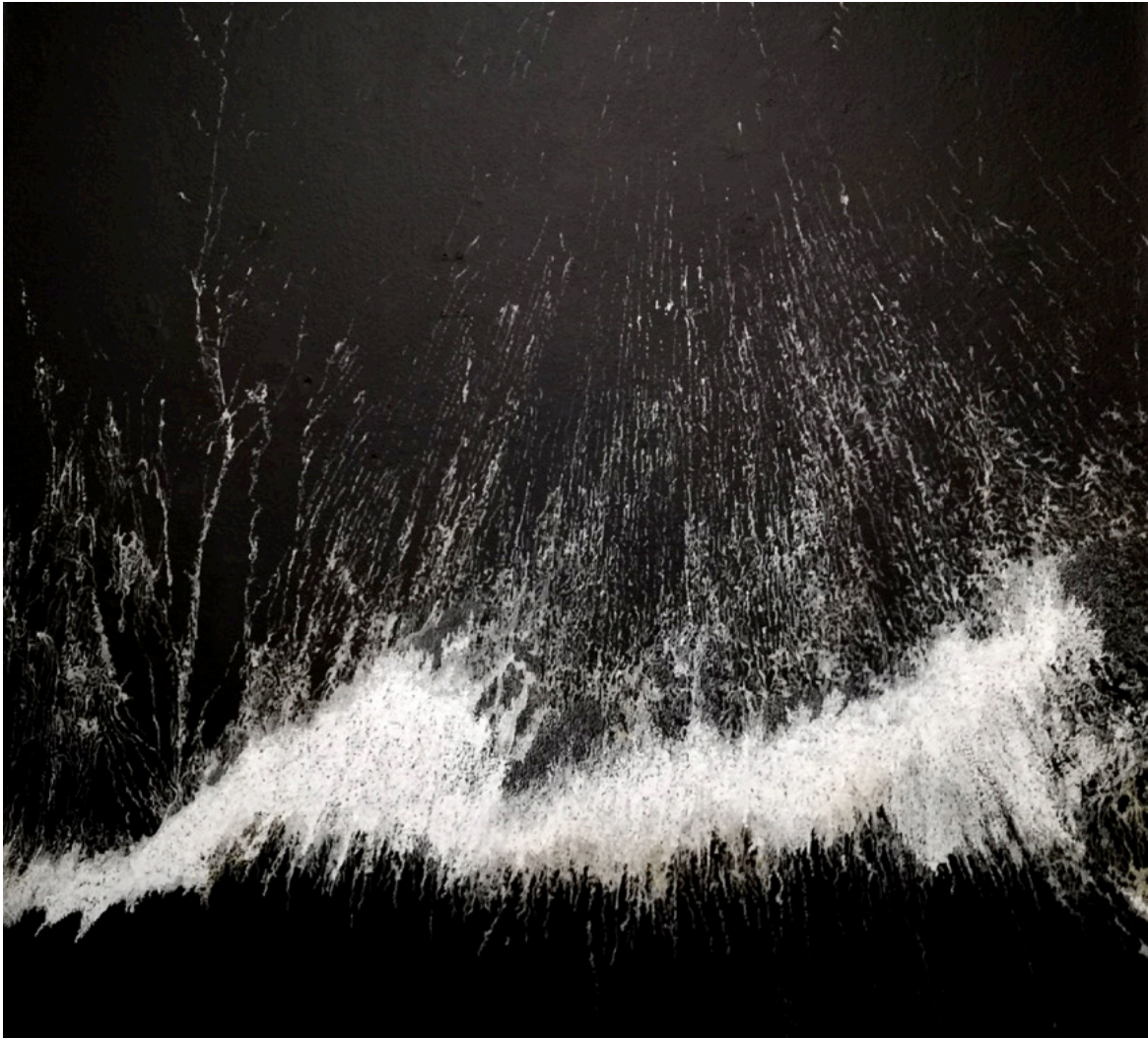
Haecceity – Site Specific wall drawings (detail) - 2018 Warrington Museum and Art Gallery.

interface', 6 the point at which surface and weather combines to immerse us through multiple senses, informing knowledge and instilling memory.