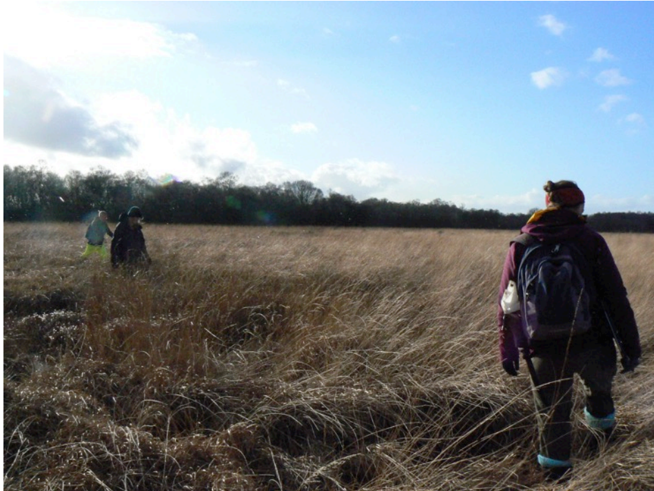
Moss identification survey with Lancashire Wildlife Trust – 2015

Wetland locations are challenging environments in which to make artwork. They require sensitivity to environmental factors as well as an understanding of the physical geography of the land. The identification and selection of locations for my projects are done in close consultation with local trusts and agencies. Four sites were identified for this project, each having played an important role historically in the development of the local community, as well as having been significantly altered over the last sixty years in the name of progress, before finally being recognised as a valuable component linking communities to their cultural history and sense of place.