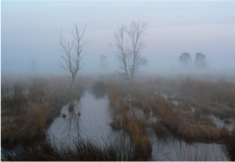
Cadishead Moss – 2015