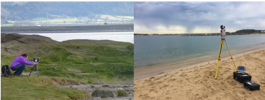
The River Mersey, UK and The Hunter River, NSW - 2016

Matrix of Movement (2016-18) investigated shifts in cultural approaches to wayfaring and navigation, with a specific focus on The River Mersey in the North West of England and The Hunter River in New South Wales, Australia. The two rivers are connected through human exploration and exploitation. They are linked through historical trade connections in the 19 th century, which led to human and material exports that fuelled the industrial revolution on both continents. The cities of Liverpool, UK and Newcastle, Australia are inextricably linked with the rivers and wetlands running through them. For their communities, the rivers and wetlands hold stories and memories of a life in tune with seasonal patterns of wet and dry, inviting tales of imagination, mystery refuge and escape. For example, the discovery of preserved individuals in the mossland landscape, such as the Iron Age 'Druid Prince' who appeared to have been drugged and then ritually sacrificed, have nurtured a 'spiritual dread'. 2