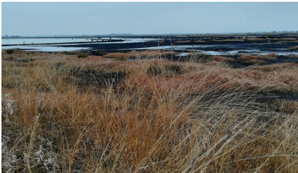
Little Woollen Moss - 2018

My recent projects Matrix of Movement (2016-18) and Haecceity (2018) bring together the worlds of fine art, ecology, environmental science and commercial surveying technology. The artworks emerging from this interdisciplinary amalgam seek to challenge our preconceptions of post-industrial landscapes. Such spaces are complex, precarious, transient and unpredictable, reinventing themselves to accommodate the changing economic and urban world which surrounds them, but never completely surrendering to the desire of human occupation. Sadly, it is my perception that these wetland spaces are seen by many as worthless, left vulnerable to industrial and military exploitation and branded as exclusion zones, reinforcing perceptions of them as empty wasteland or terra nullius – land belonging to no one. Thus, commercial interests are free to take profit from what they advocate as the necessary and progressive reclamation of land, and in doing so cause destruction and the subsequent extinction of these living landscapes.