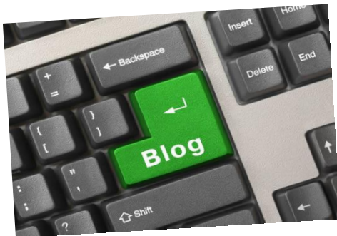
Figure 2: Blogging is a Pushbutton away.

Many of sites and tools for blogging may be found in the internet. Many companies found that offering blogging services as an end product, is a profitable business letting the rising and establishment of blogging industry to grow on and on.