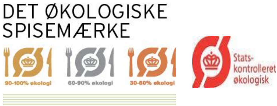
Figure 2. The Danish labeling system for food serving, building on the Danish national organic label, which is a red “Ø”. In Danish, organic is “Økologisk”.

In January 2009 a new organic state controlled label system for large scale kitchens called “spisemærket” (The Eating Label) where introduced. The label symbol is the same as the “Ø-mærke” (the official Danish label for organic certification), and comes in three colors: Bronze, silver and gold. Each colour represents the use of a different amount of organic ingredients (in weight or cost).