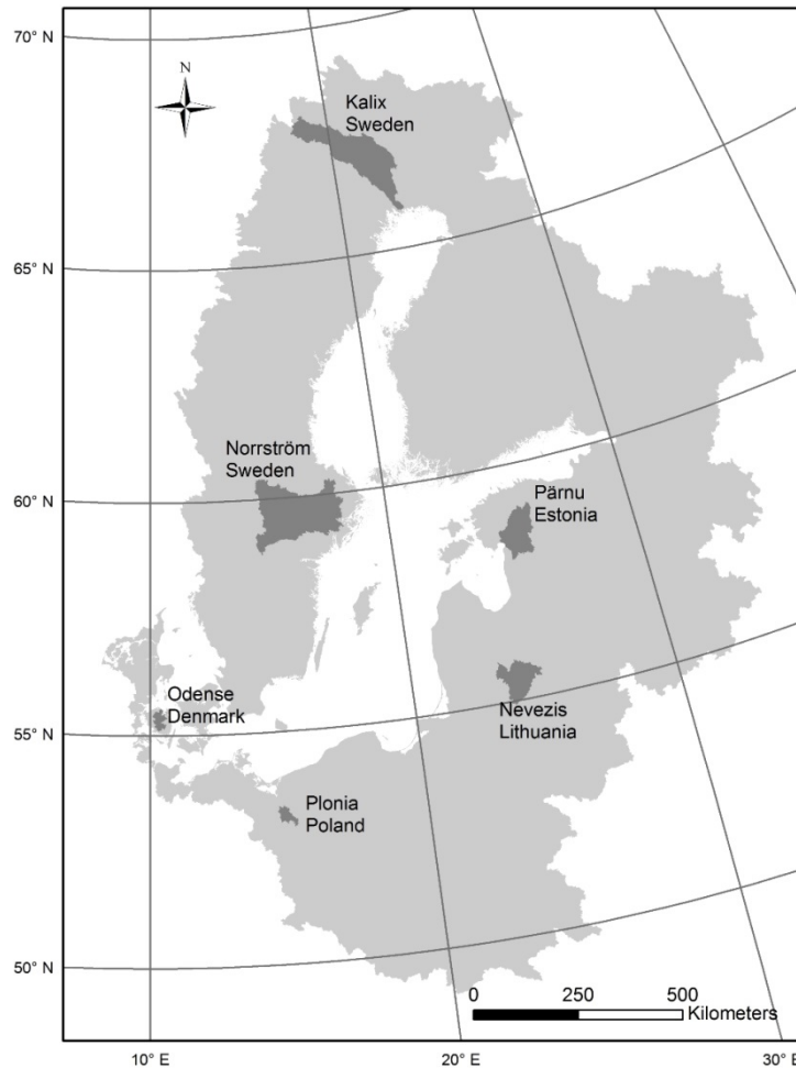
Figure 1. Map of the six type catchments around the Baltic Sea.

basin. The combined area of the six pilot catchments was about 55,000 km 2 , i.e., approximately 3% of the total Baltic Sea catchment area. The six type catchments represented ranges in climate, land use, and agricultural practices (Table 1).