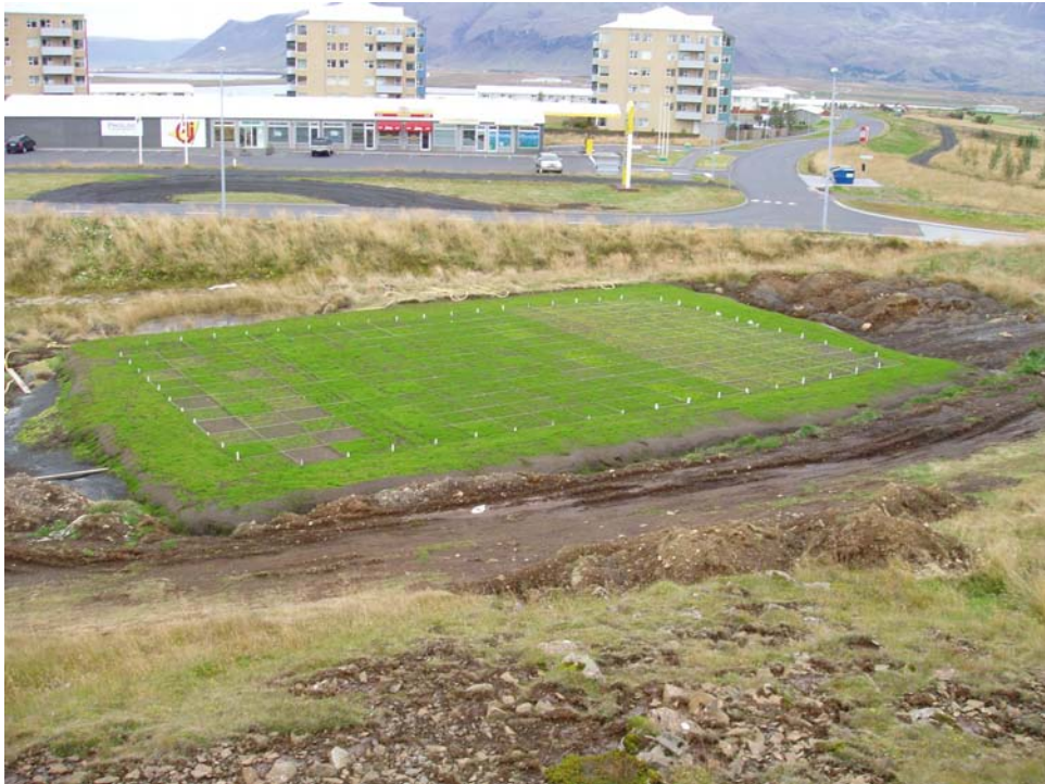
Photo 3. The variety green at Keldnaholt, September 2007.