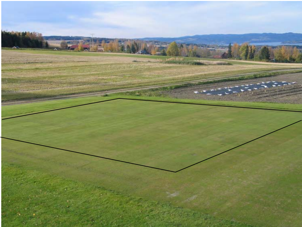
Photo 1. The variety green at Apelsvoll, October 2007.