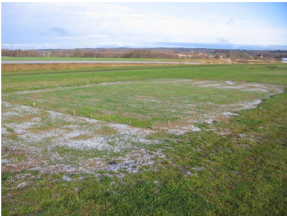
Photo 4. The variety green at Östra Ljungby, October 2007.