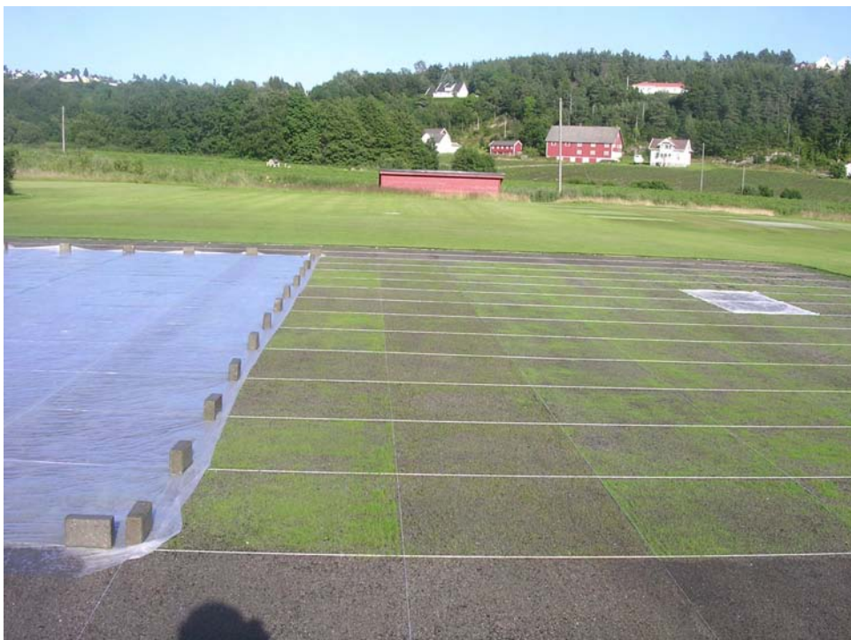
Photo 2. The variety green at Landvik, July 2007.