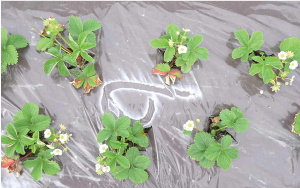
Fig. 3. Open field flowering in 2013 of 'Sonata' bare root A15 plants in Mid-Norway.