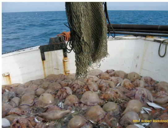
Fig. 2: 'Fish' catch in February 2004 in the Gulf of Trieste.

In contrast to long-term qualitative data about the presence of jellyfish in the northern Adriatic, limited quantitative abundance estimates are available. After rather high abundances of barrel jellyfish in 2003, the Piran Marine Biology Station (MBS) started a more systematic survey in 2004. These jellyfish were numerous during cold months, from December to February, decreased from summer 2005 onwards (Table 1), and was < than 10 ind./km 3 in May 2006. Our regular quantitative