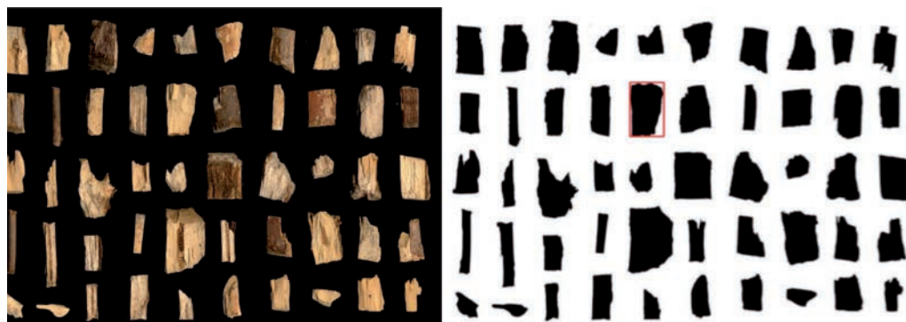
Figure 1. Scanned image of chips (left) and segmented image (right).

The result of cluster analysis (UPGMA based on Euclidean distance) on both shape descriptors (Fourier descriptors) and size descriptors (area, perimeter, Feret diameters, eccentricity, etc.) has been reported in Figure 3 to observe the chips distribution according to their descriptors derived from image analysis. For graphical convenience, vertical lines are used to connect branches at the similarity levels of the nodes.