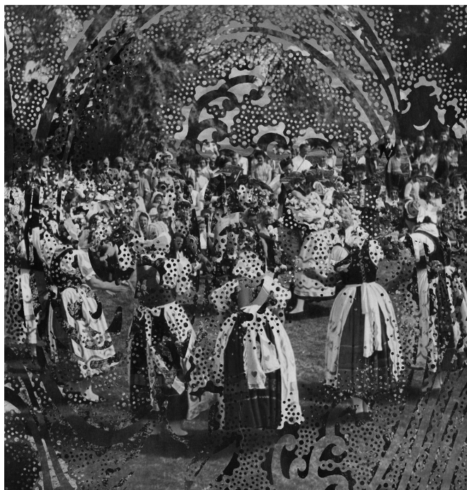
Figure 3 People , by Henna Nadeem

Henna Nadeem's People , made in 2006 (Figure 3), which the exhibition featured prominently.