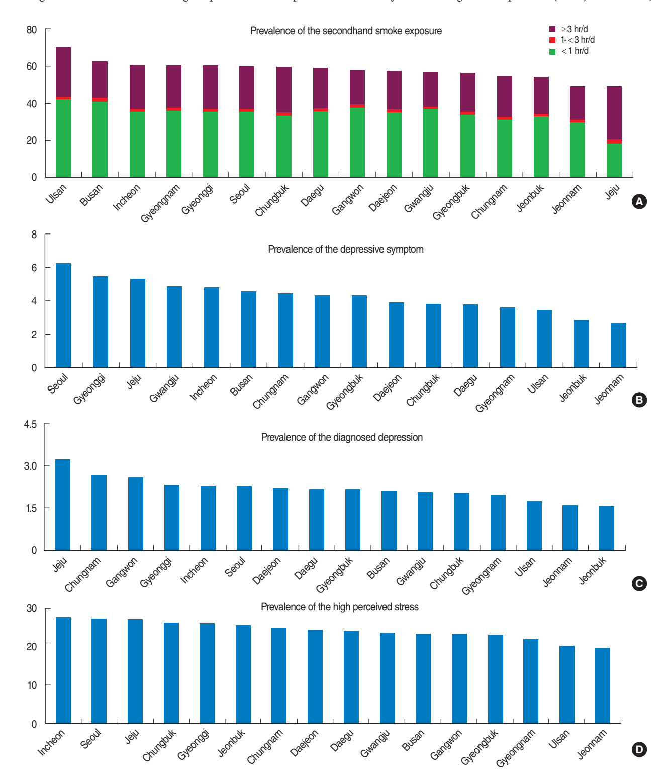
Figure 1. Prevalence of the secondhand smoke exposure (A) and mental health problems (B: depressive symptom, C: diagnosed depression, and D: high perceived stress) by region.

sive symptoms (6.2%), while those with SHSE of < 1 hr/d were more likely to have diagnosed depression (3.0%). Meanwhile,