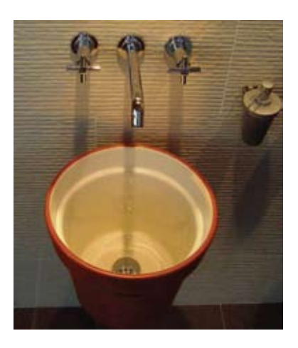
Figure 1. Example of a current washbasin (Yılmaz, 2009).

Ceramic production includes a grueling process. It means that optimizations may be quite difficult and may cost a lot for the company. However, when QFD is a part of the production process, it supplies the company with more customer satisfaction and sales guarantees. In this study, we choose the QFD method provided by Gleen H. Mazur (Mazur 2008) to examine a ceramic washbasin in order to analyze the performance