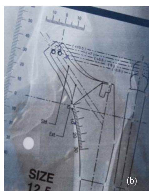
Figure 2. Template Examples. (a) System 1 applicable as lateralized stem matches center of rotation of the templated acetabular component. (b) System 1 would not be applicable as the stem has too much offset to match the center of rotation of the templated acetabular component.

one head option. Neck length and offset were independent of body size for both systems. Based upon templating, the categories were: No obvious advantage of either system, System 1 preferred, System 2 preferred, Neither system adequate. Preference was determined based upon providing at least one additional length or offset option, and avoiding the extra extended offset option in System 2 based upon the risk of fracture or disassociation due to extremely high moments [6,7]. Examples of templates are depicted in Figure 2.