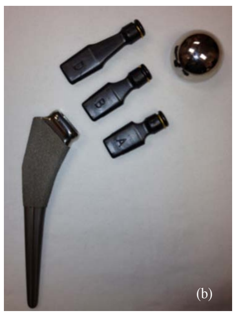
Figure 1. (a) In System 1, there are two neck length and two neck offset choices. The stem on the left is a reduced neck length, standard offset. The stem on the right has standard length and offset. (b) In System 2, multiple neck lengths and offsets can be used with any body. The neck length of the head is always +0.