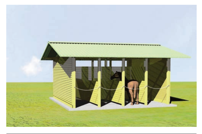
Figure 4. Perspective view of the temporary stay horse shelter.