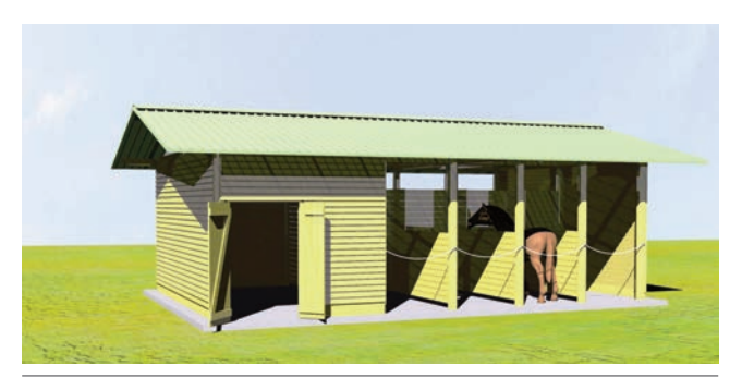
Figure 2. Perspective view of the overnight stay horse shelter.