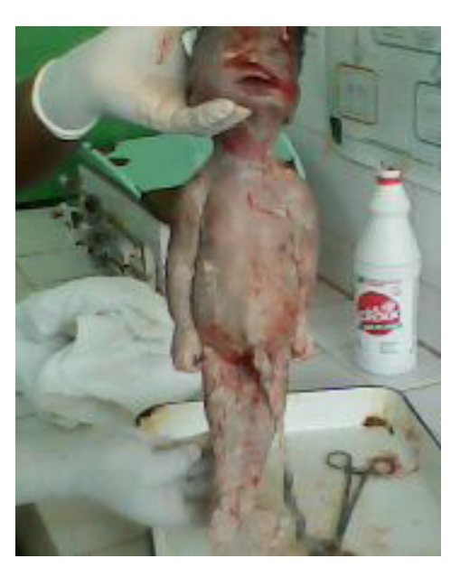
Figure 2. Complete morphological view of sirenomelic foetus.