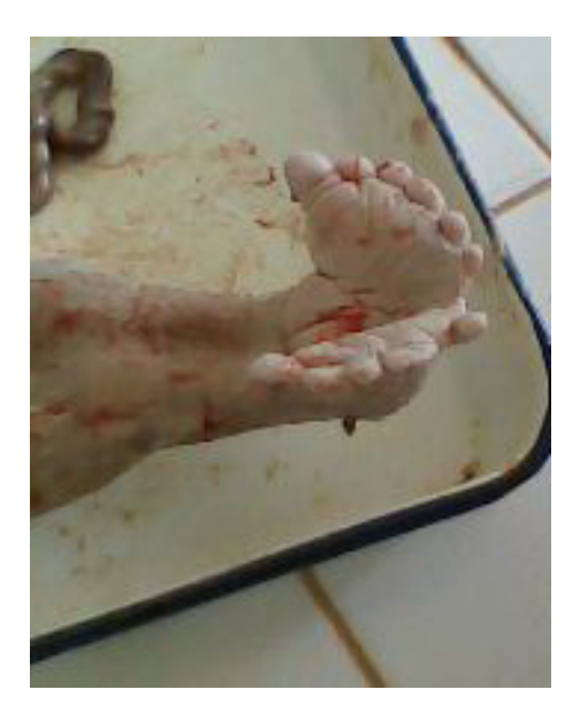
Figure 6. Photograph showing the fused feet with 11 toes.

fused lower segment of the body below the pelvis into a single lower limb, with two feet fused posteriorly giving a single flipper-like foot with eleven toes spread out in a fan-like pattern (Mermaid-like or 'mammy-water'). The foot was oriented anteriorly relative to the trunk, and external palpation gave the impression of probably two femurs and two tibias.