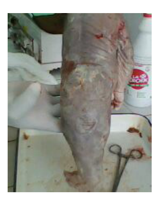
Figure 3. Posterior view showing fused lower limbs, imperforate anus.