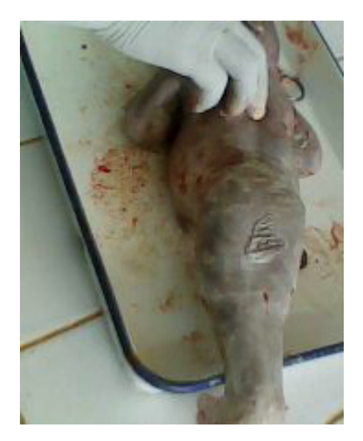
Figure 4. Imperforate anus.